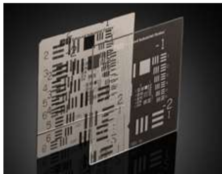
#57-896 - 2" x 2" Positive, USAF 1951 Target C$432.60