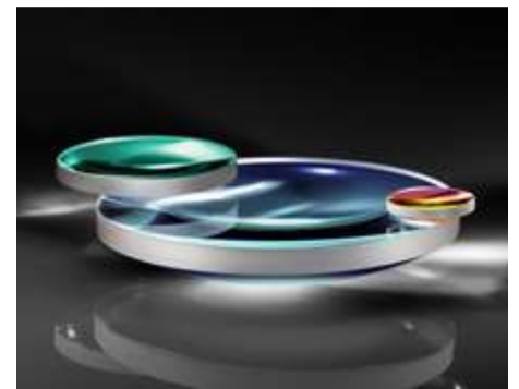
#65-525 - 25.0mm Diameter x 50.0mm FL, 785nm V-Coat, PCX Lens C$82.60