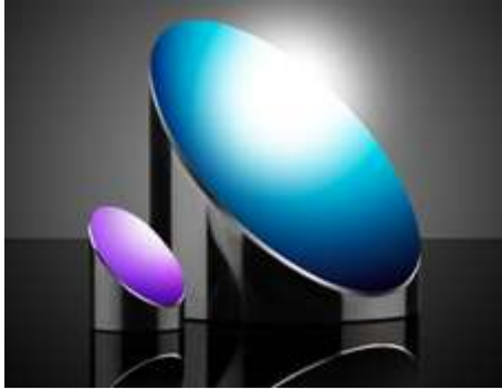
Laser Line Coated Off-Axis Parabolic (OAP) Mirrors