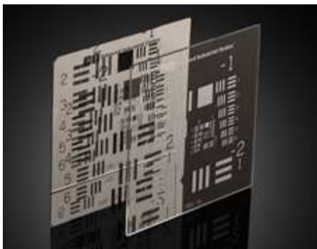
#57-895 - 2" x 2" Negative, USAF 1951 Target C$432.60