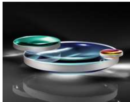
#65-524 - 25.0mm Diameter x 25.0mm FL, 785nm V-Coat, PCX Lens C$85.40