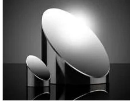
Silver Off-Axis Parabolic Mirrors