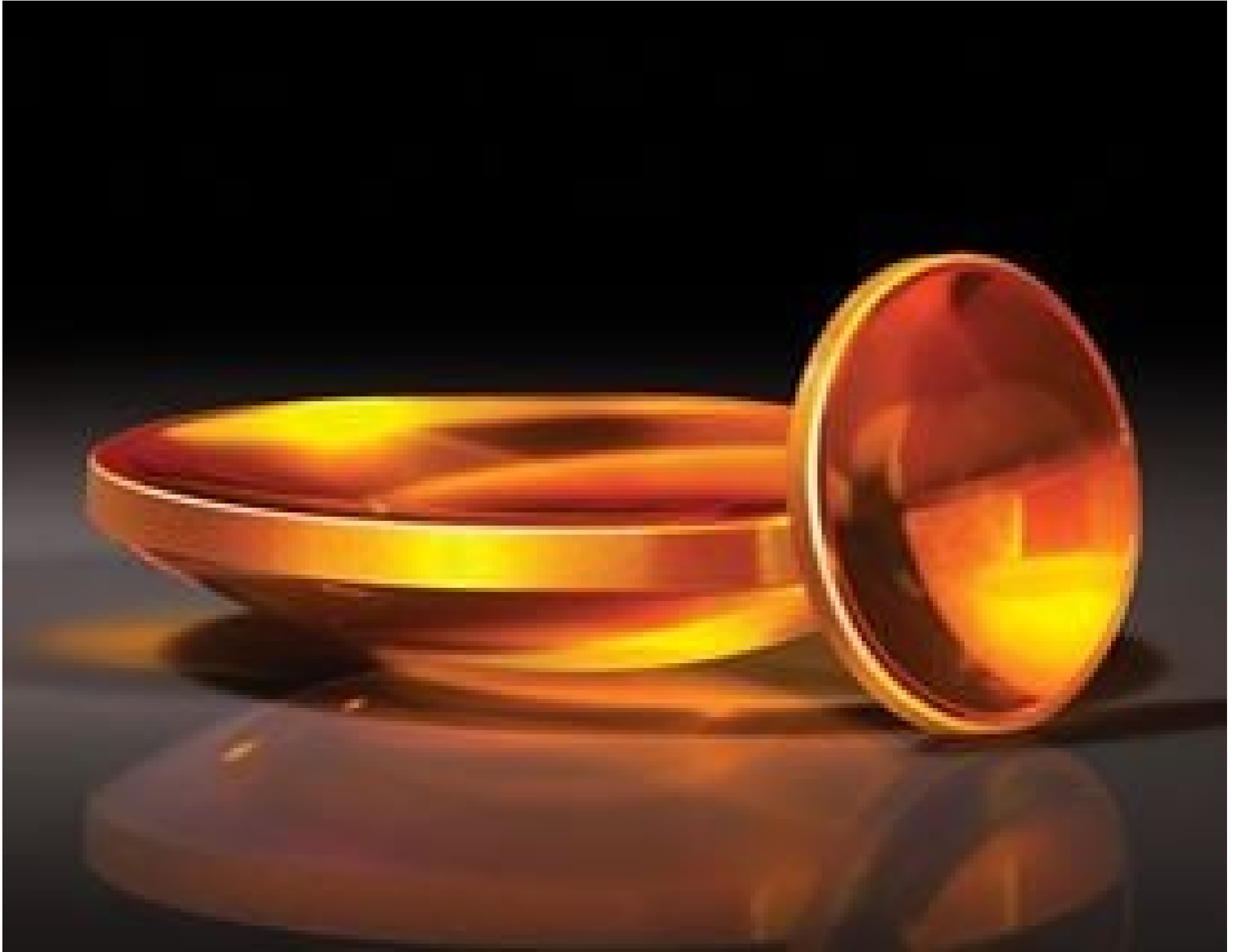
TECHSPEC Zinc Selenide (ZnSe) Aspheric Lenses