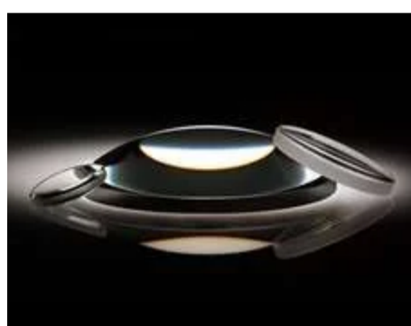
#47-391 - 40.0mm Dia. x 300.0mm FL, VIS-NIR Coated, Plano-Convex Lens C$105.70