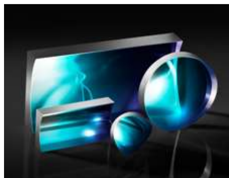
Illumination Grade PCV Cylinder Lenses