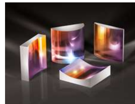
Laser Grade Broadband Cylinder Lenses