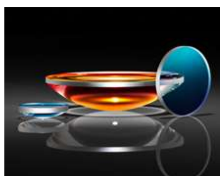
#48-969 - 25mm Dia. x 200mm FL VIS 0° Coated, UV Plano-Convex Lens C$226.80