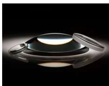
#47-392 - 40.0mm Dia. x 400.0mm FL, VIS-NIR Coated, Plano-Convex Lens C$105.70