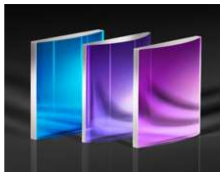
Laser Grade Laser Line Cylinder Lenses