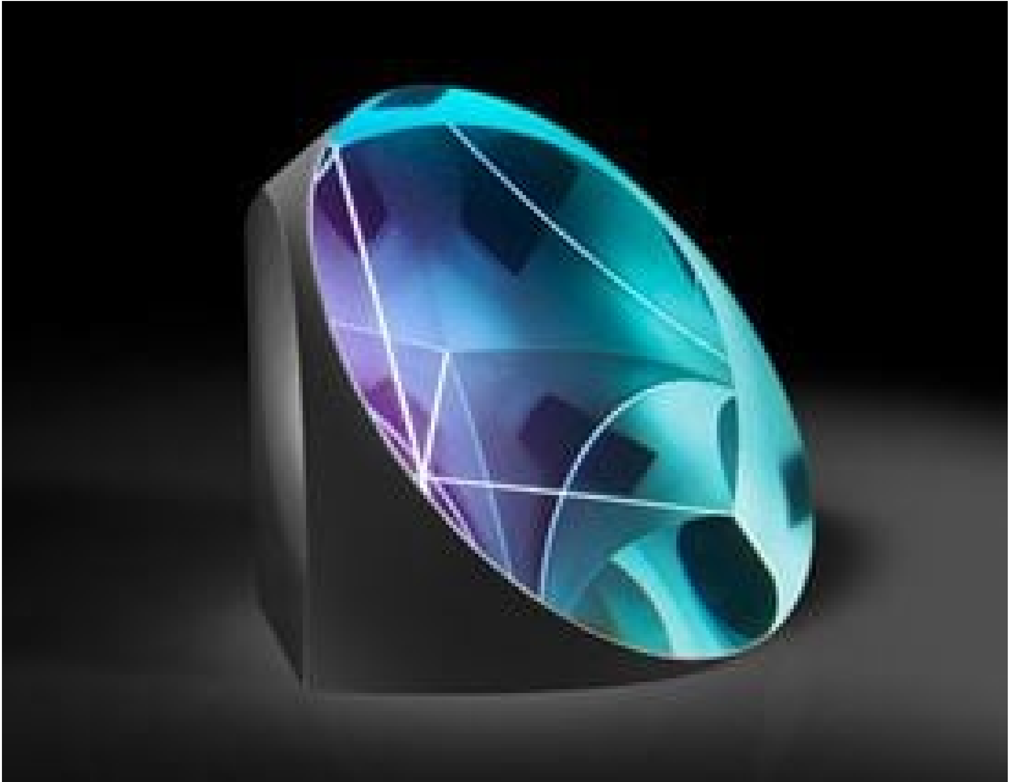
N-BK7 Corner Cube Retroreflectors with Black Overpaint