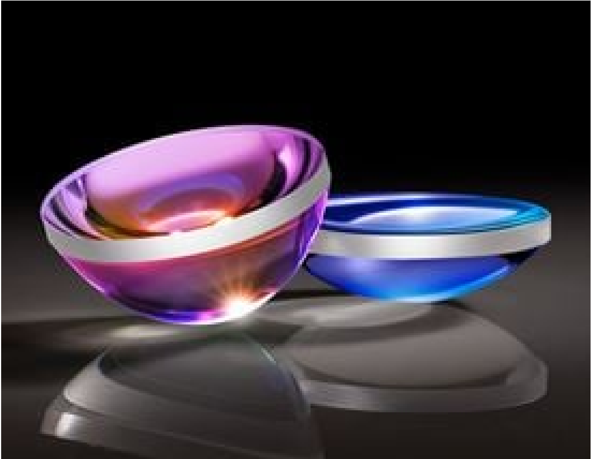
TECHSPEC UV Fused Silica Aspheric Lenses