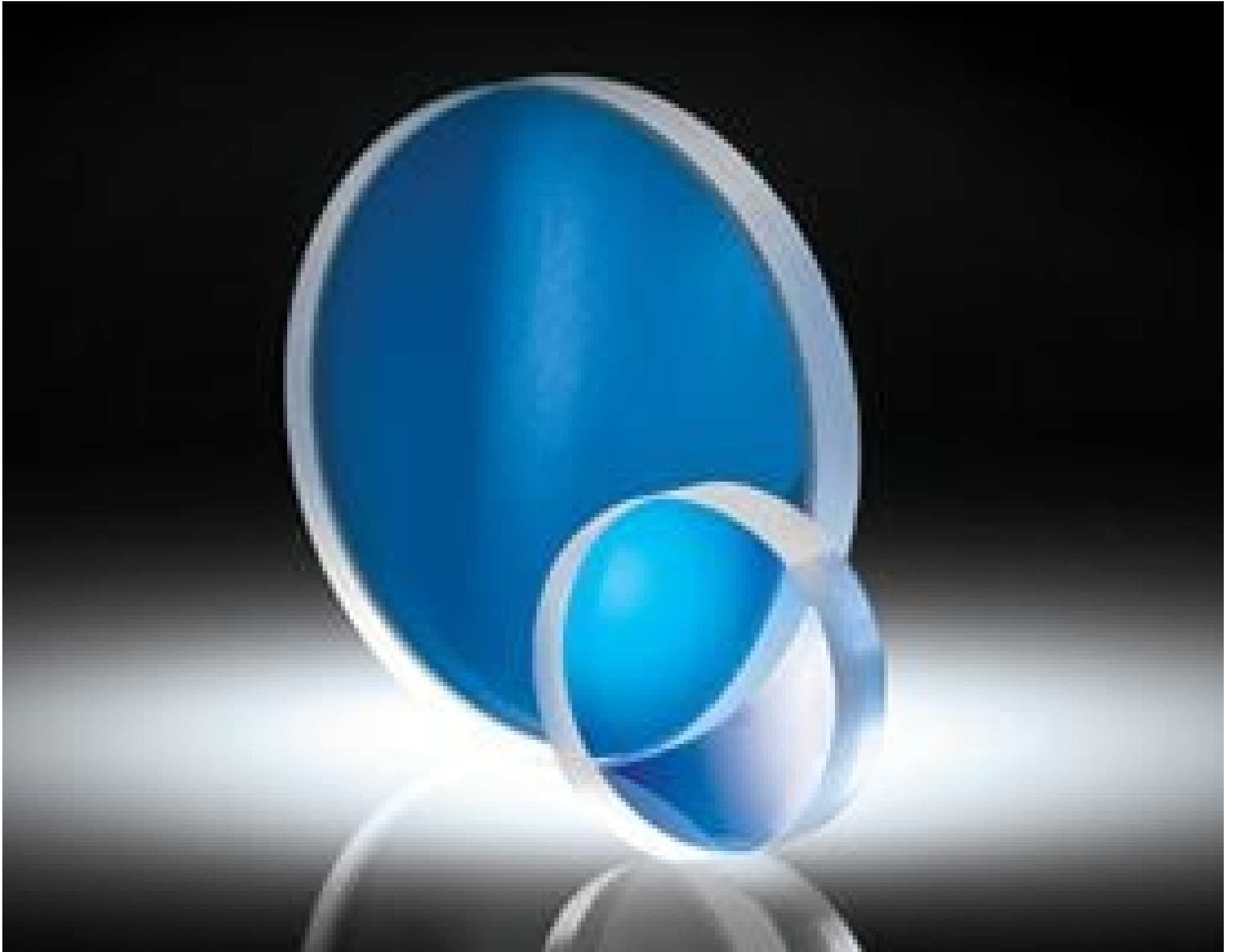
Spherical Aberration Compensation Plates