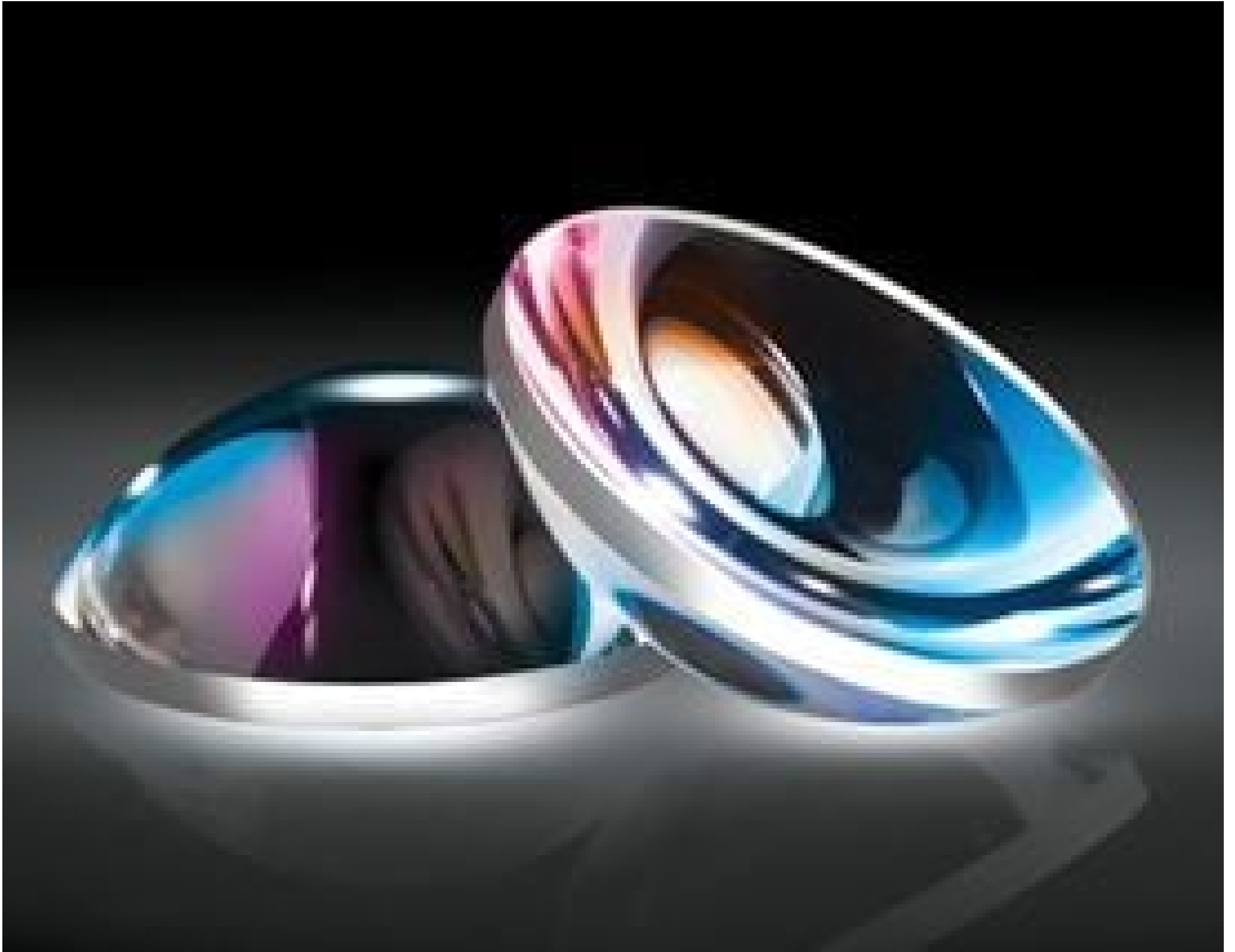
Calibration Grade Aspheric Lenses