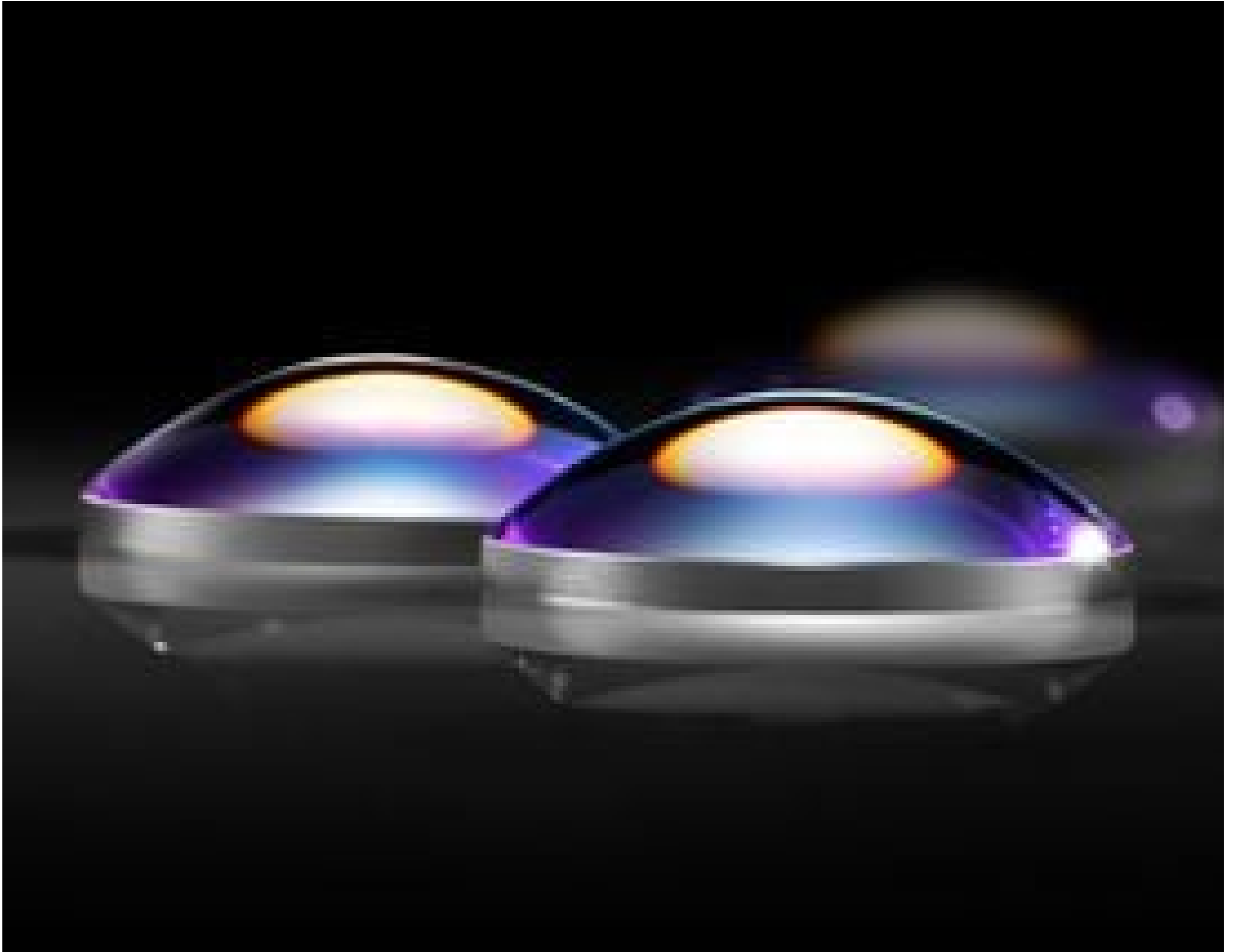
TECHSPEC® Precision Molded Aspheric Lenses