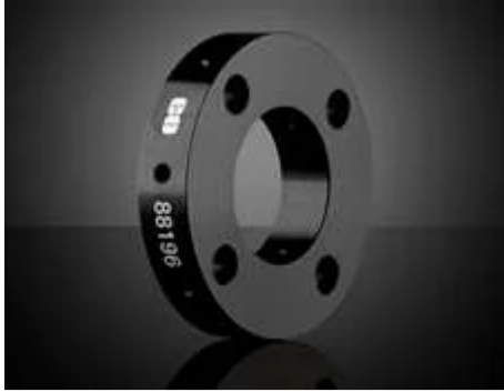
Cage System Mounting Plates