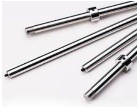
#39-351 - 3/4" Dia Stainless Posts, Vertical Post 12" C$130.20