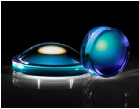
#33-426 - LightPath 354125 | 11mm Dia., 0.50 NA, BBAR (600-1050nm), Molded Aspheric Lens C$166.60