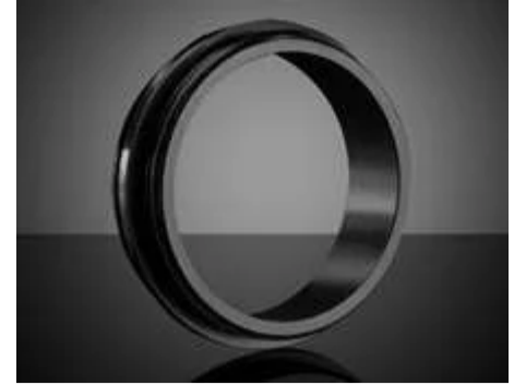
M23.2 and M27.5 Tube Adapters & Accessories