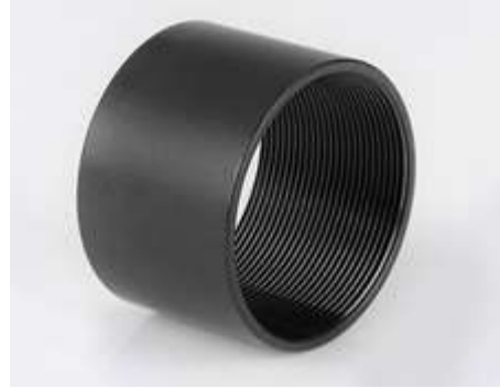
M23.2 and M27.5 Fixed Tubes and Retaining Rings