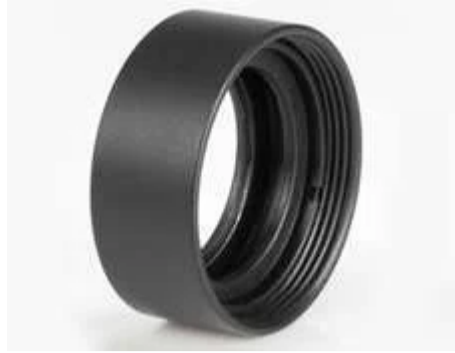
Cage System Optical Lens Mounts