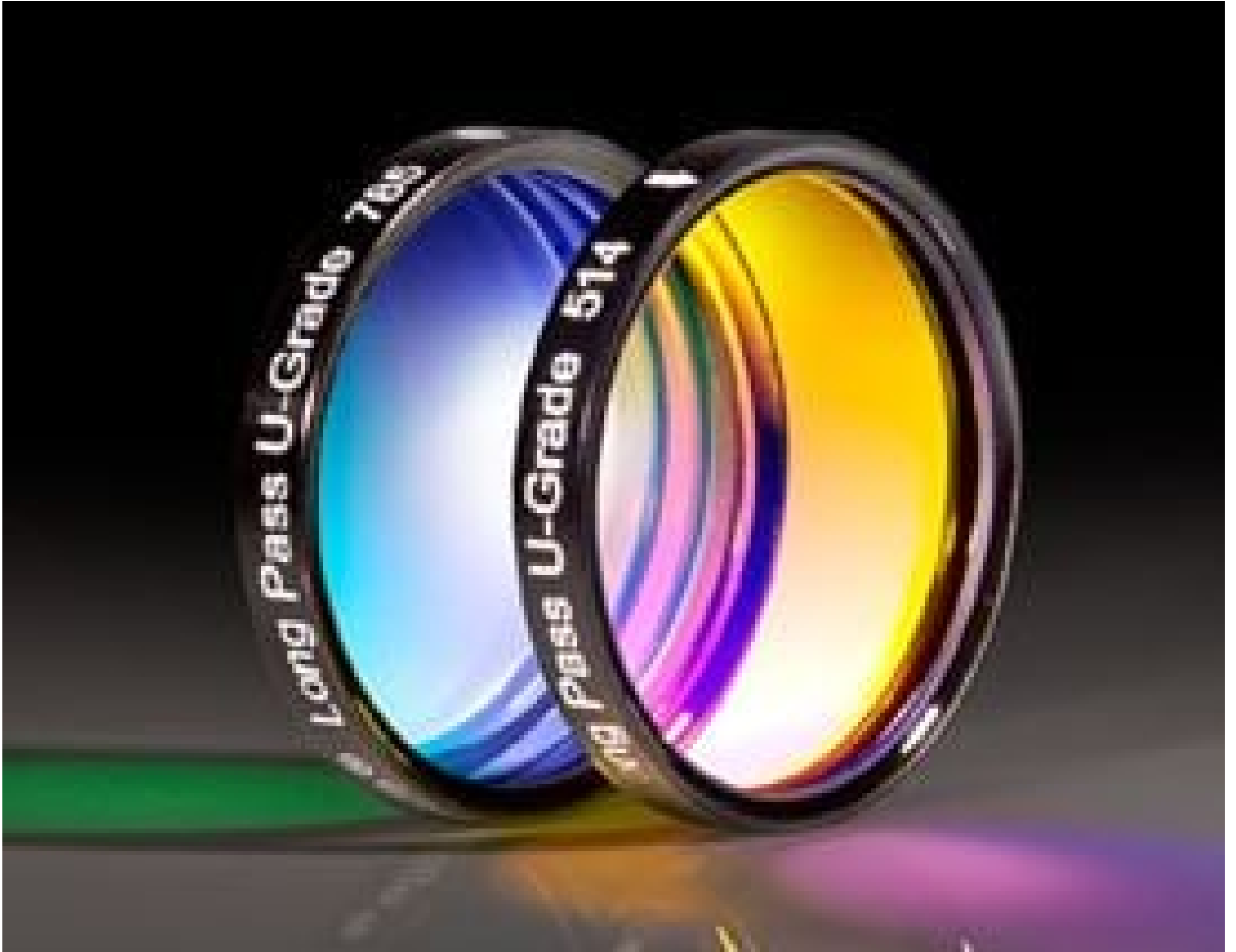
Laser Line Longpass Filters