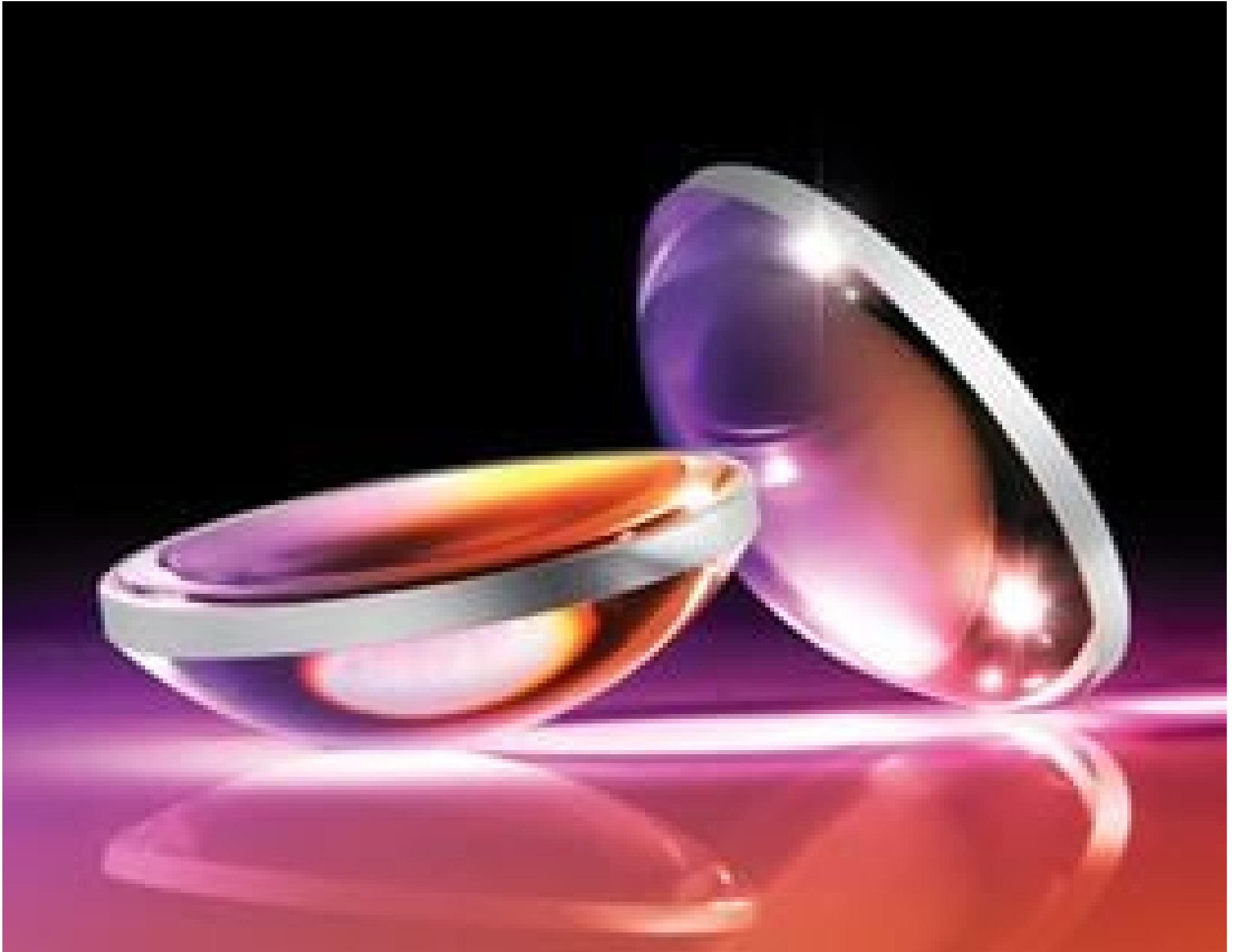
Hyperbolic Aspheric Lenses