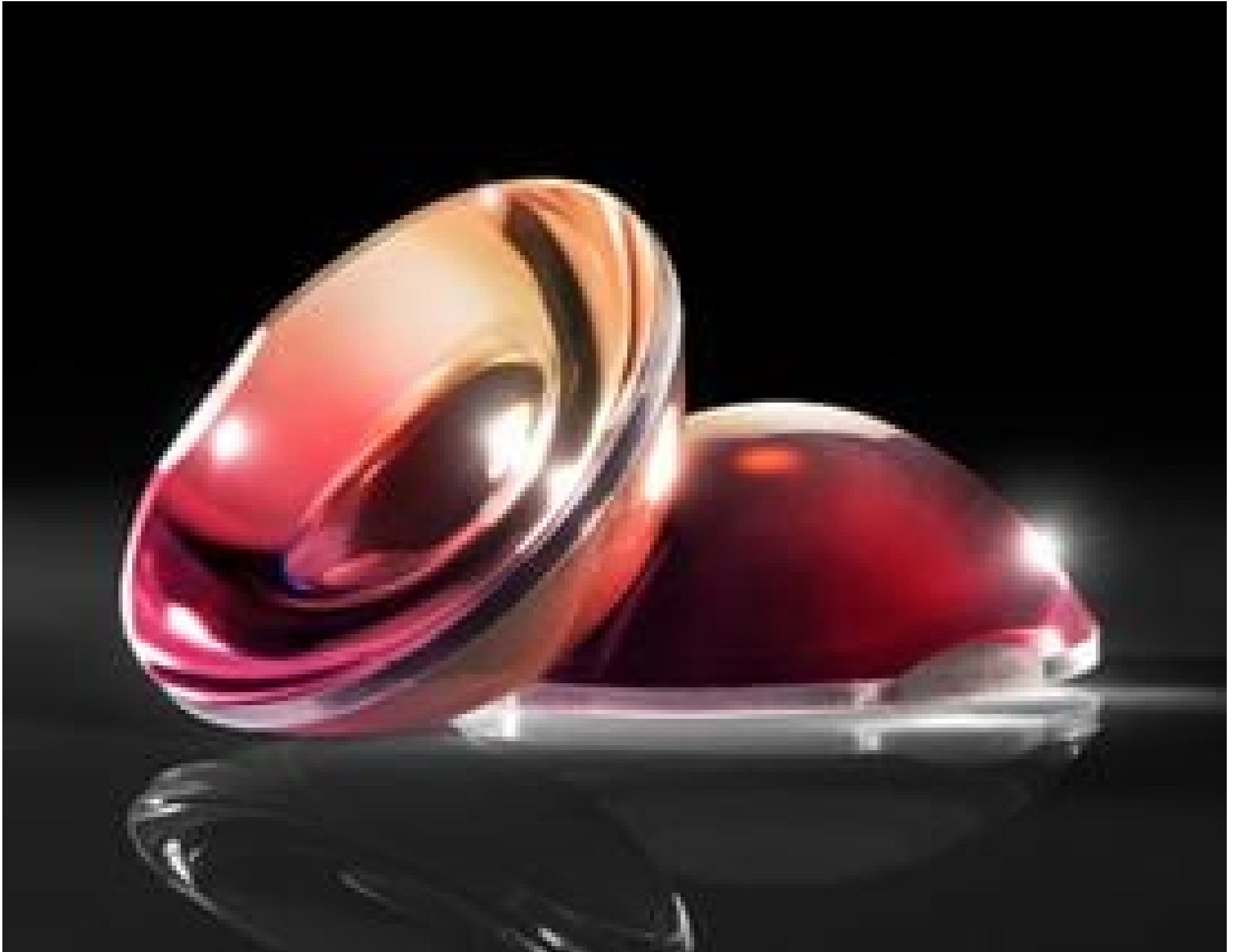
TECHSPEC® Plastic Aspheric Lenses