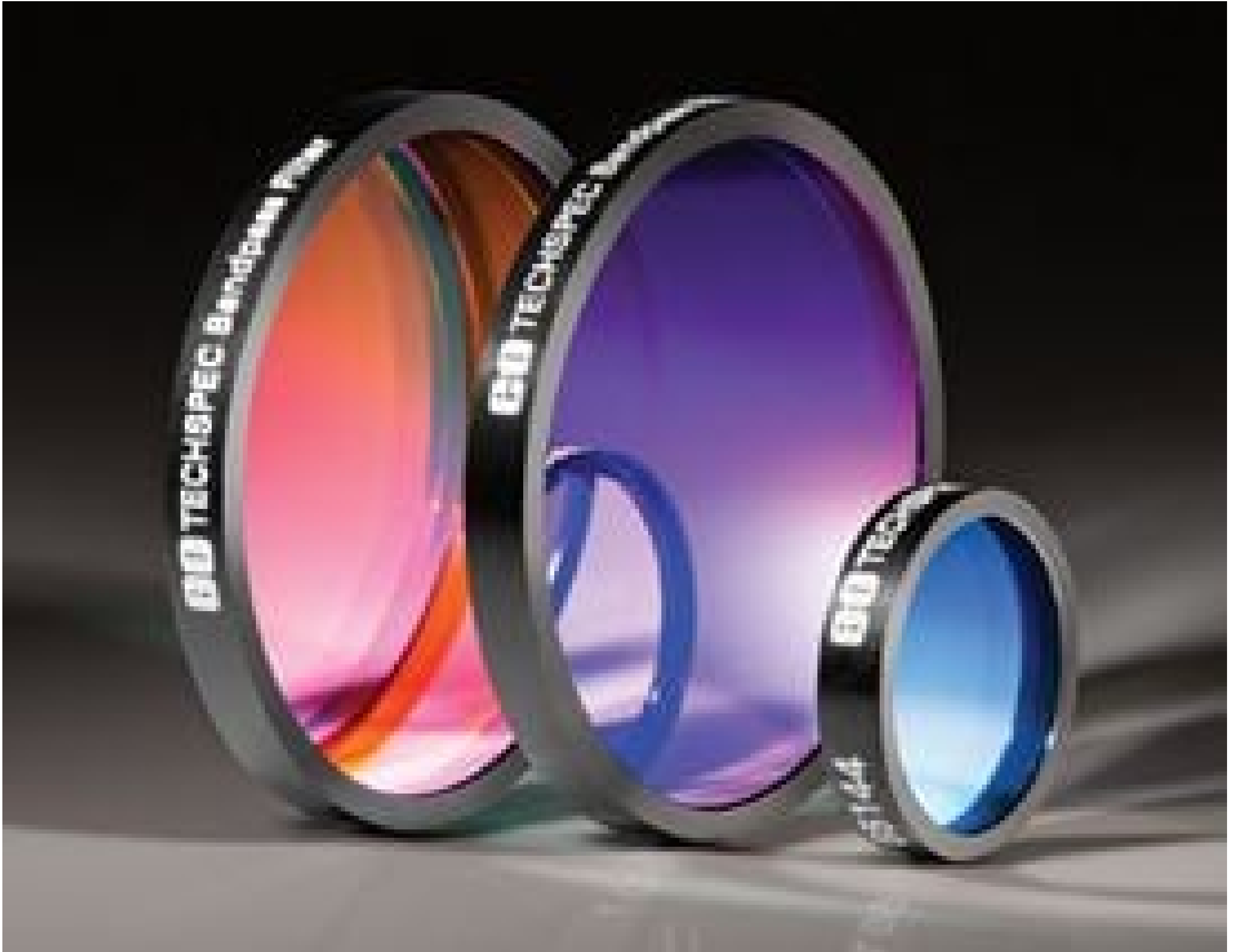
TECHSPEC Hard Coated OD 4.0 5nm Bandpass Filters