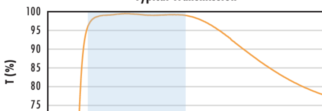
N-BK7 with VIS-EXT Coating Typical Transmission

Typical transmission of a 3mm thick N-BK7 window with VIS-EXT (350-700nm) coating at 0° AOI.