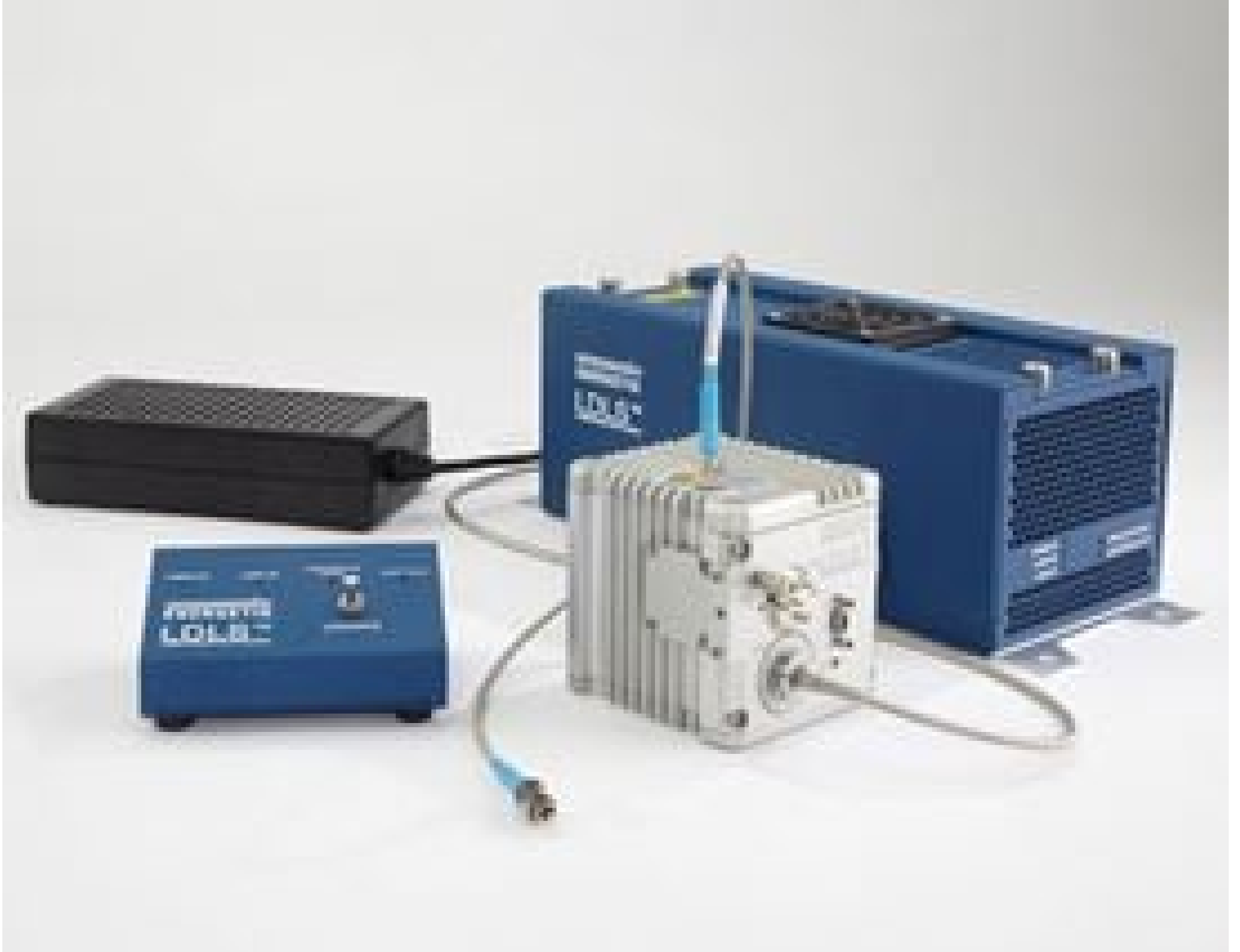
Energetiq Fiber Coupled Laser-Driven Light Source (Fiber not Included)