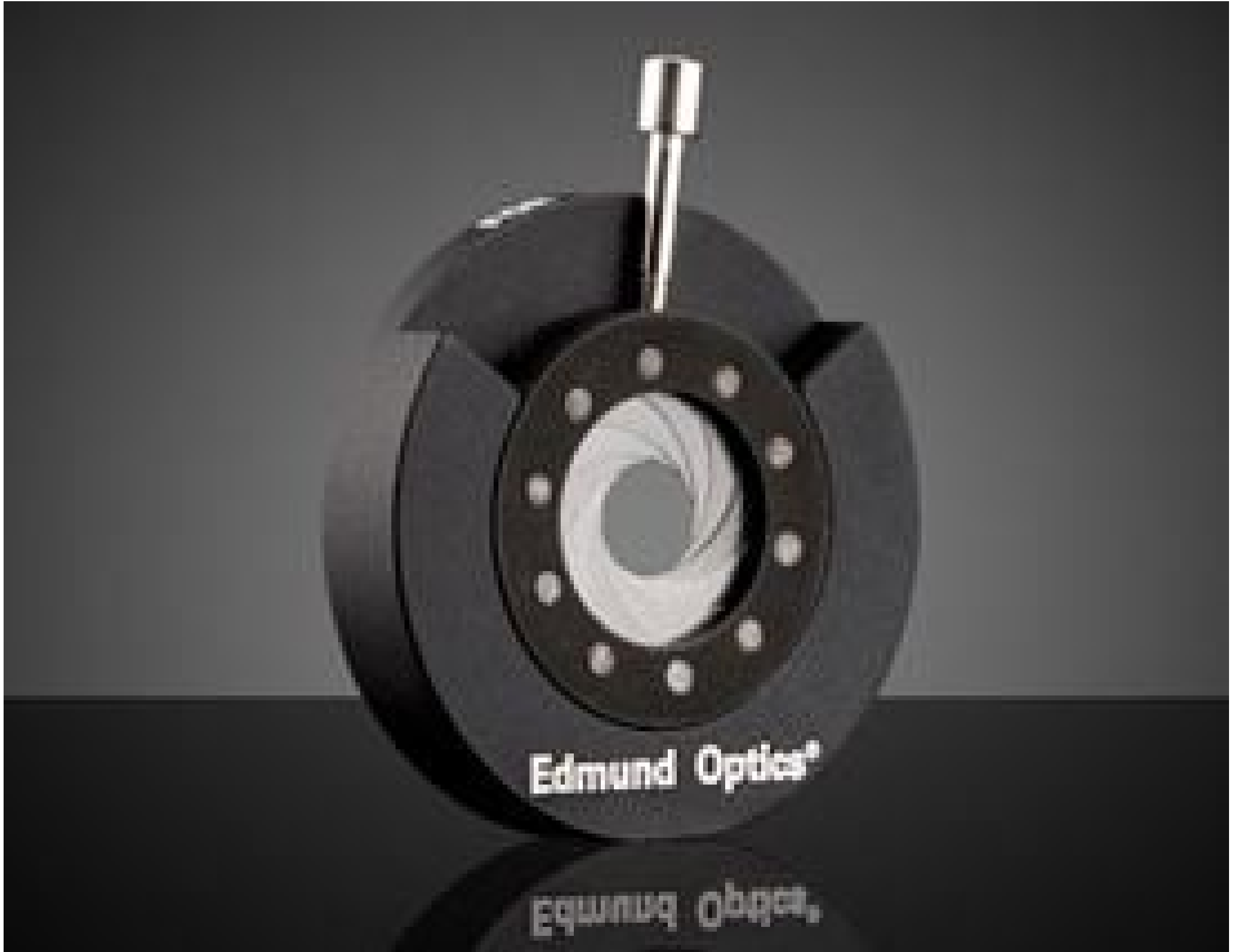
30.8mm Outer Diameter, Mounted Iris Diaphragm, #53-914