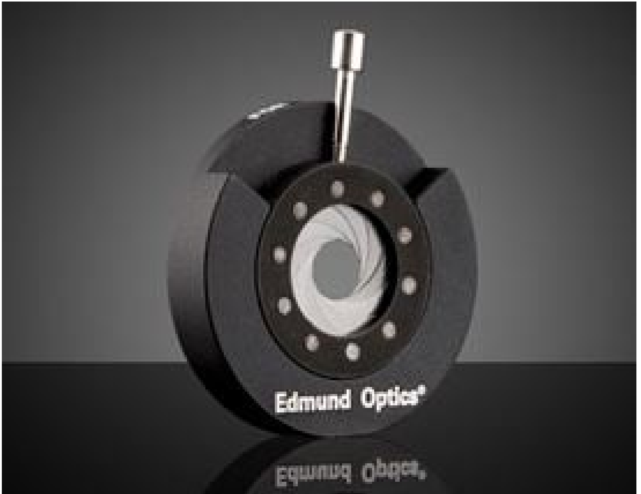
30.8mm Outer Diameter, Mounted Iris Diaphragm, #53-914