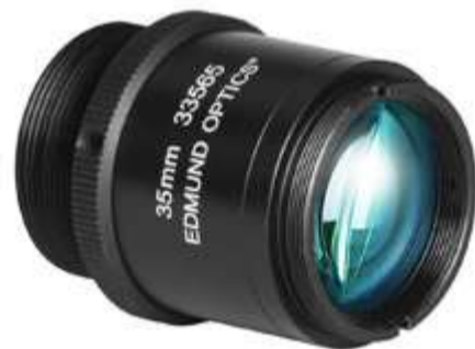
#33-565 - 35mm Cx Series Fixed Focal Length Lens C$491.40