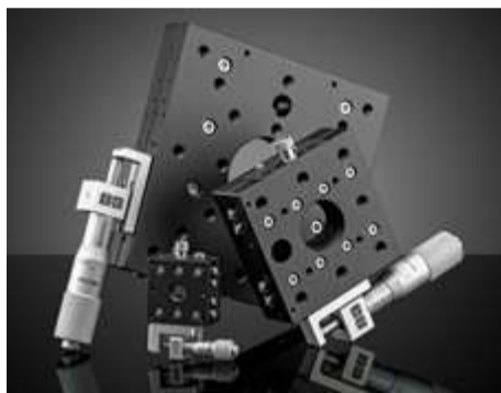
Crossed-Roller Bearing Linear Translation Stages (Thru-Hole Model)