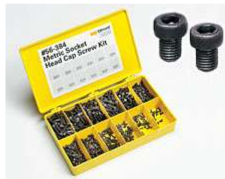
Socket Head Cap Screws