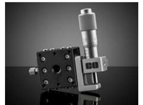
Stages and Slides