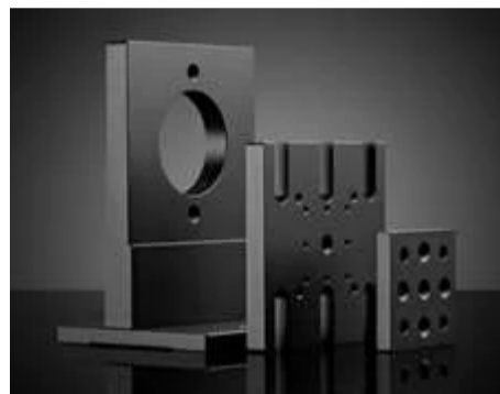
Stage Adapter Plates and Accessories