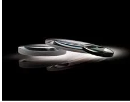
#45-164 - 30mm Dia. x 50mm FL, MgF 2 Coated, Double-Convex Lens C$81.20