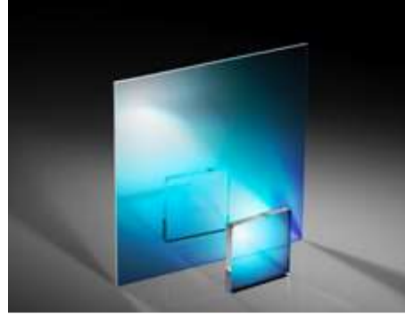
#46-609 - 35 x 35mm, 25R/75T, Plate Beamsplitter C$98.00