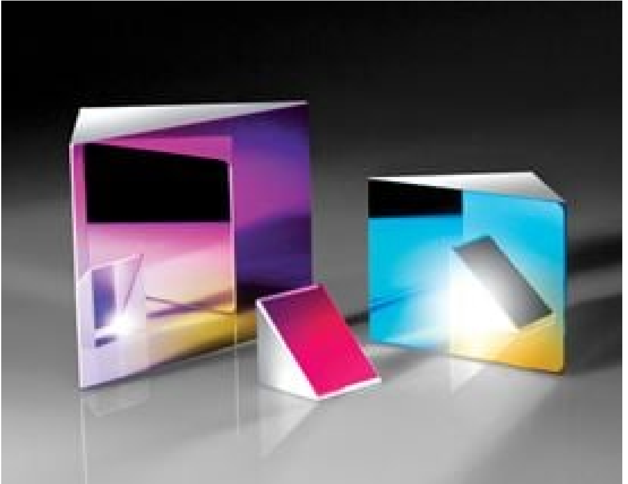
Broadband Dielectric Coated Right Angle Mirrors