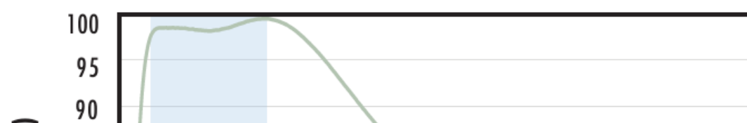
Fused Silica with UV-AR Coating Typical Transmission

Typical transmission of a 3mm thick fused silica window with UV-AR (250-425nm) coating at 0° AOI.