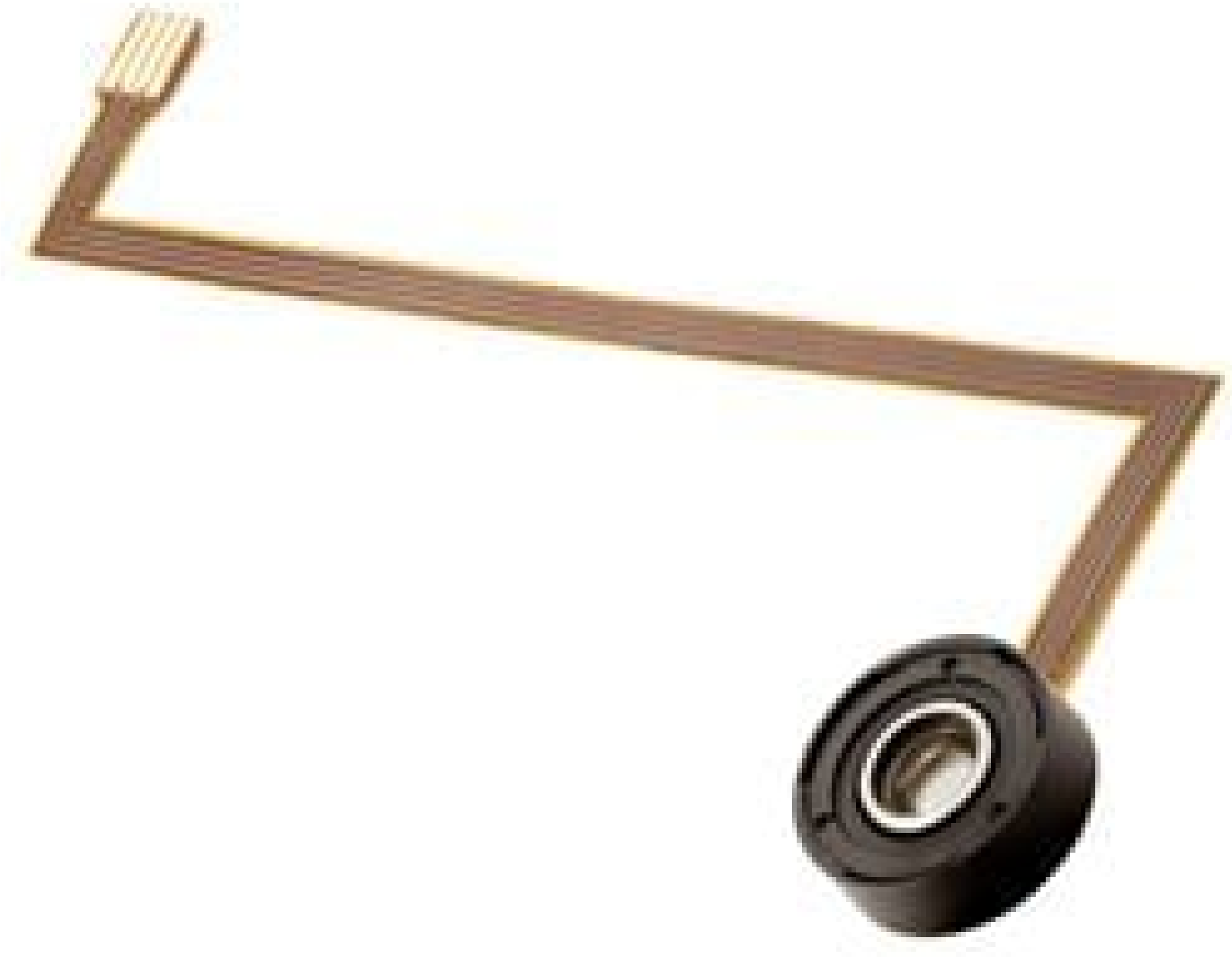
3.9mm CA, A-39N0-P04 Corning® Varioptic® Variable Focus Liquid Lens, Packaged A-Series