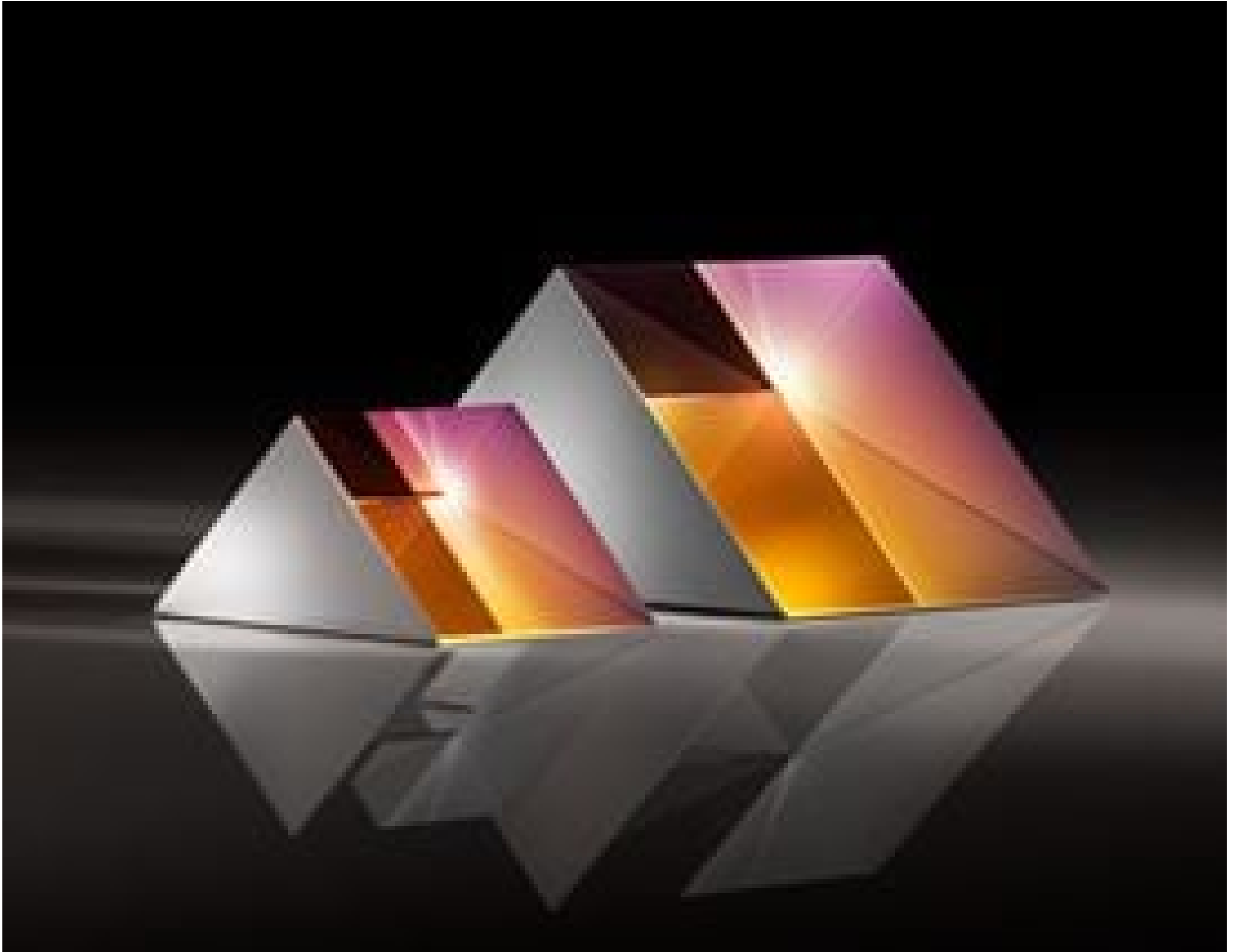
TECHSPEC UV Fused Silica Right Angle Prisms