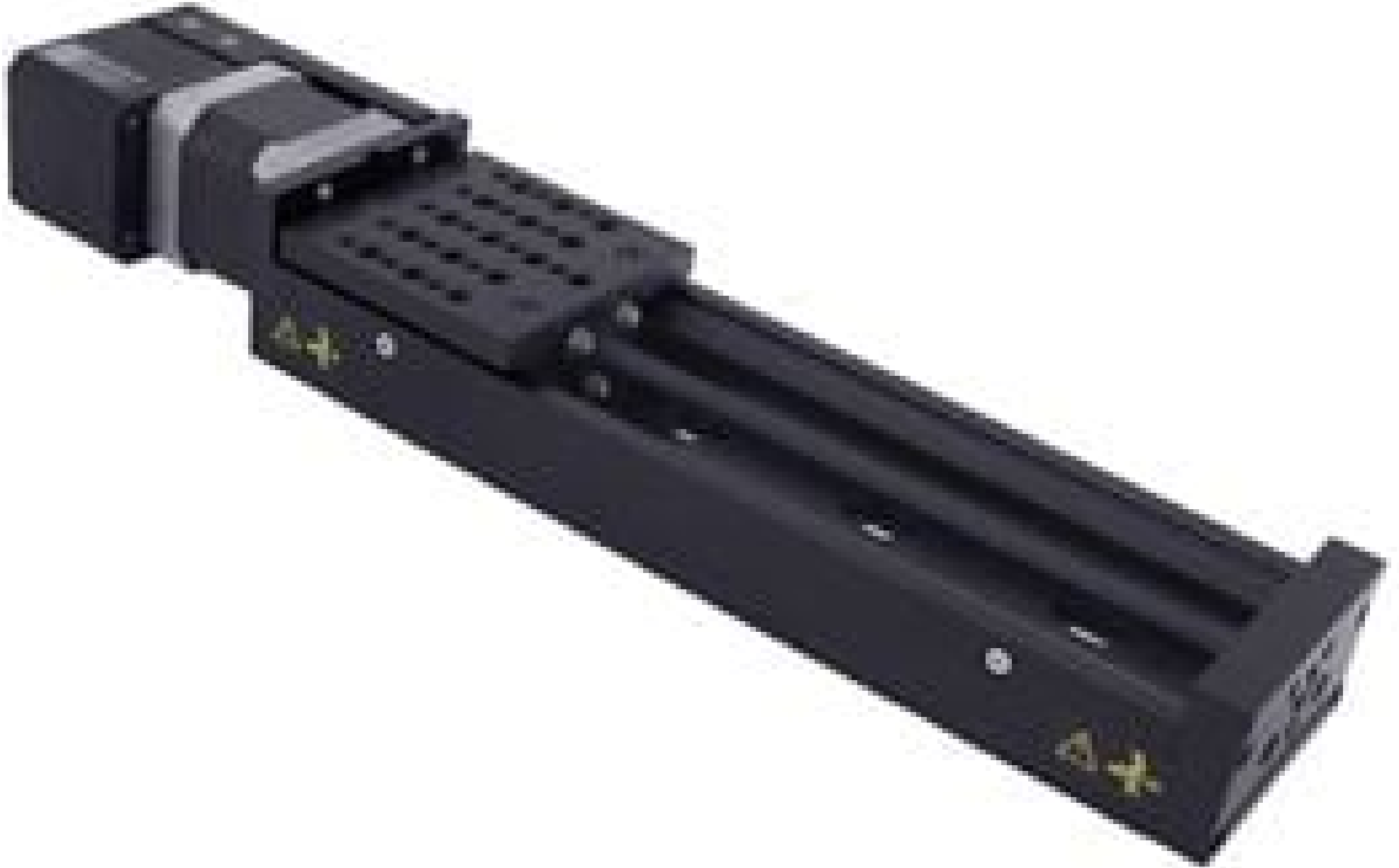
150mm Travel, Motorized Linear Stage, #15-289