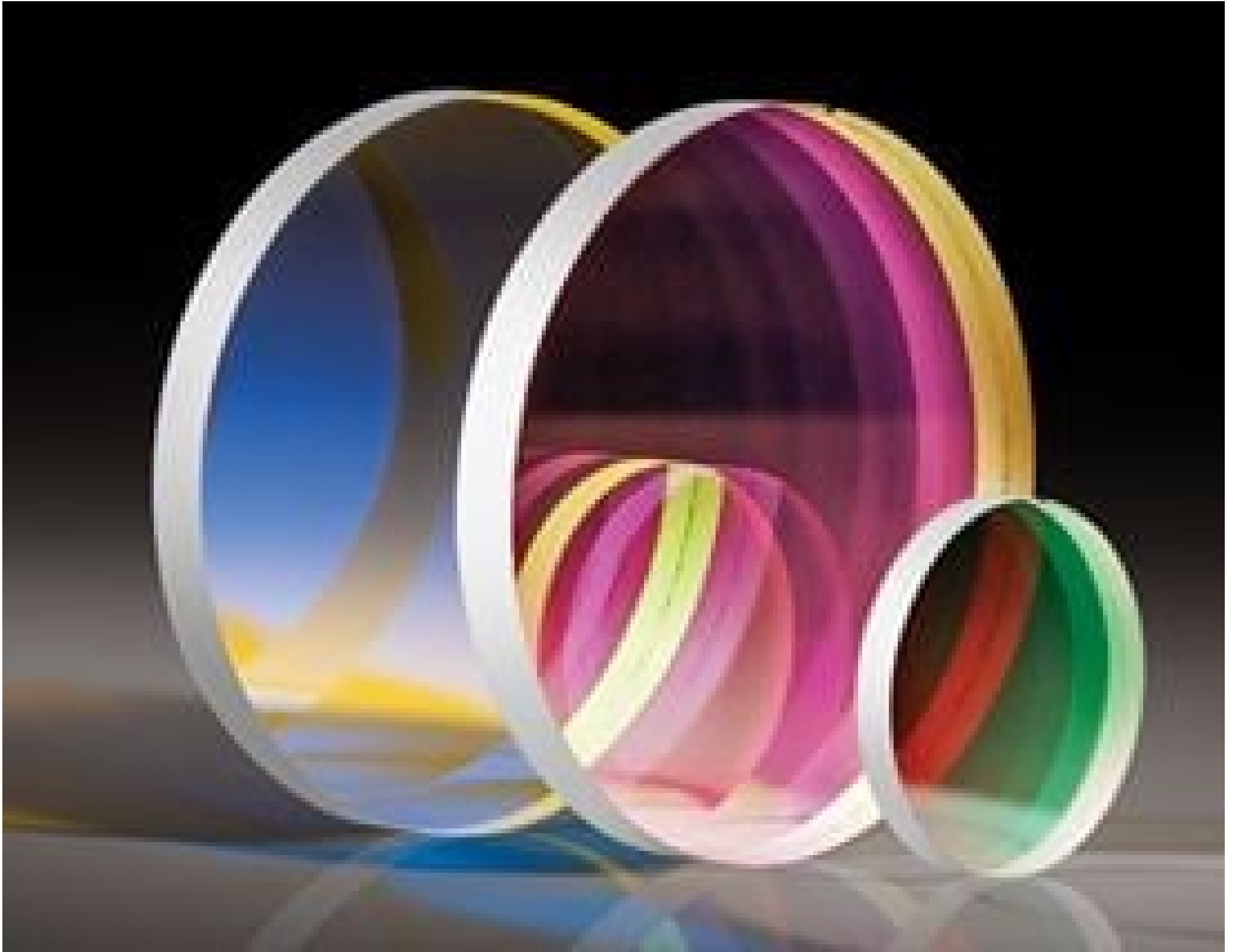
High Performance OD 4.0 Longpass Filters