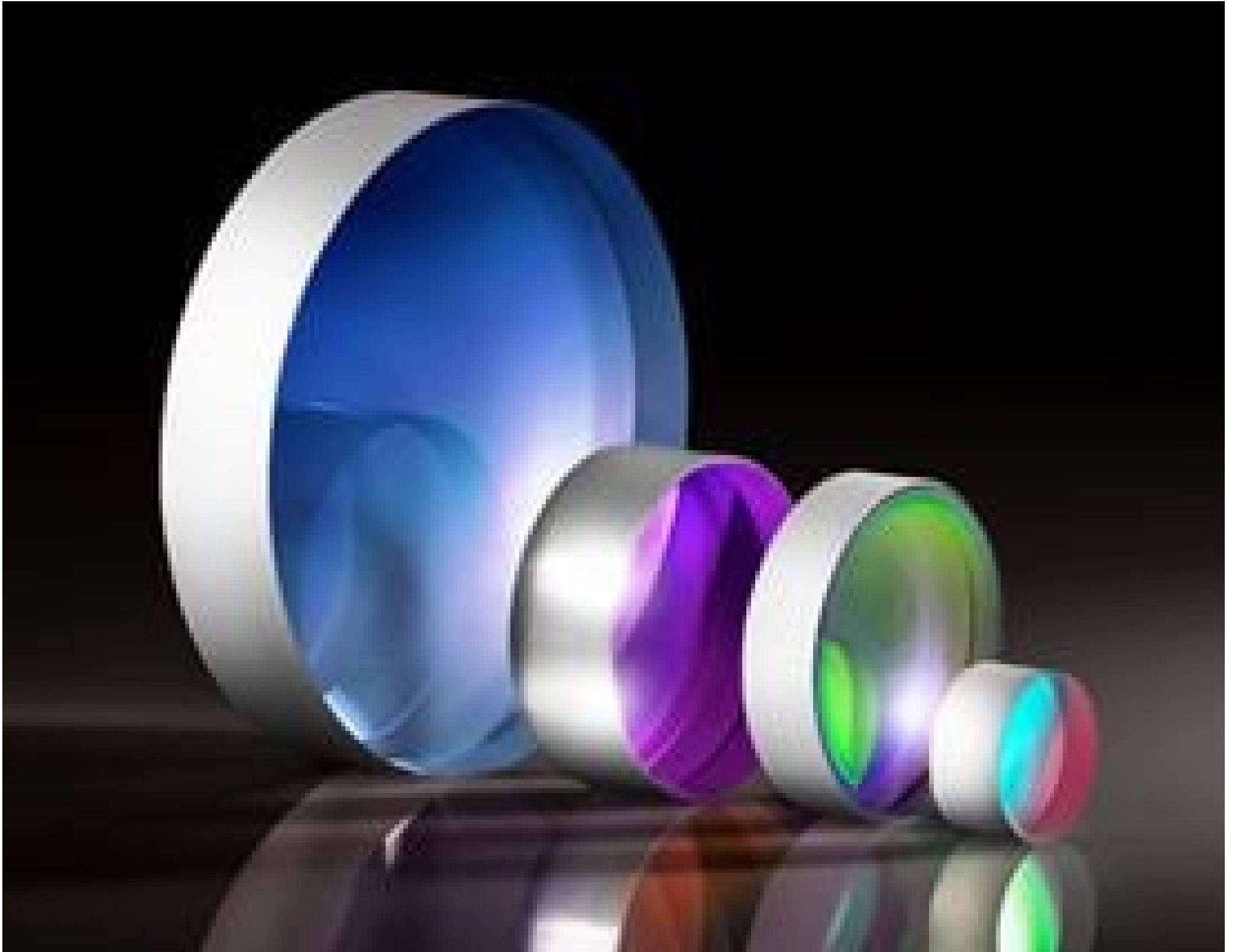
TECHSPEC® Yb:YAG Laser Line Mirrors