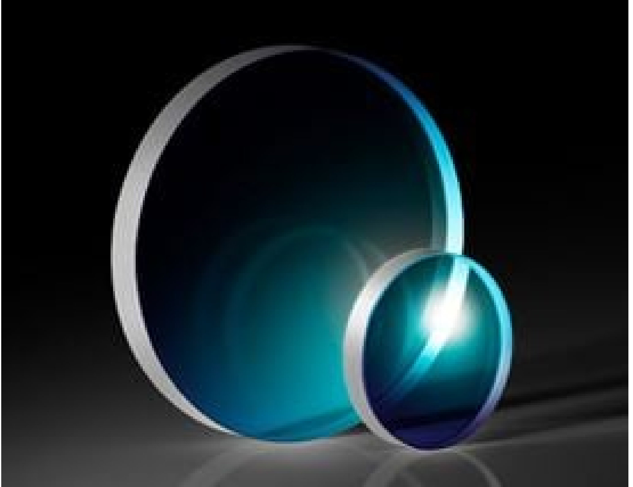
Barium Fluoride (BaF 2 ) Wedged Windows