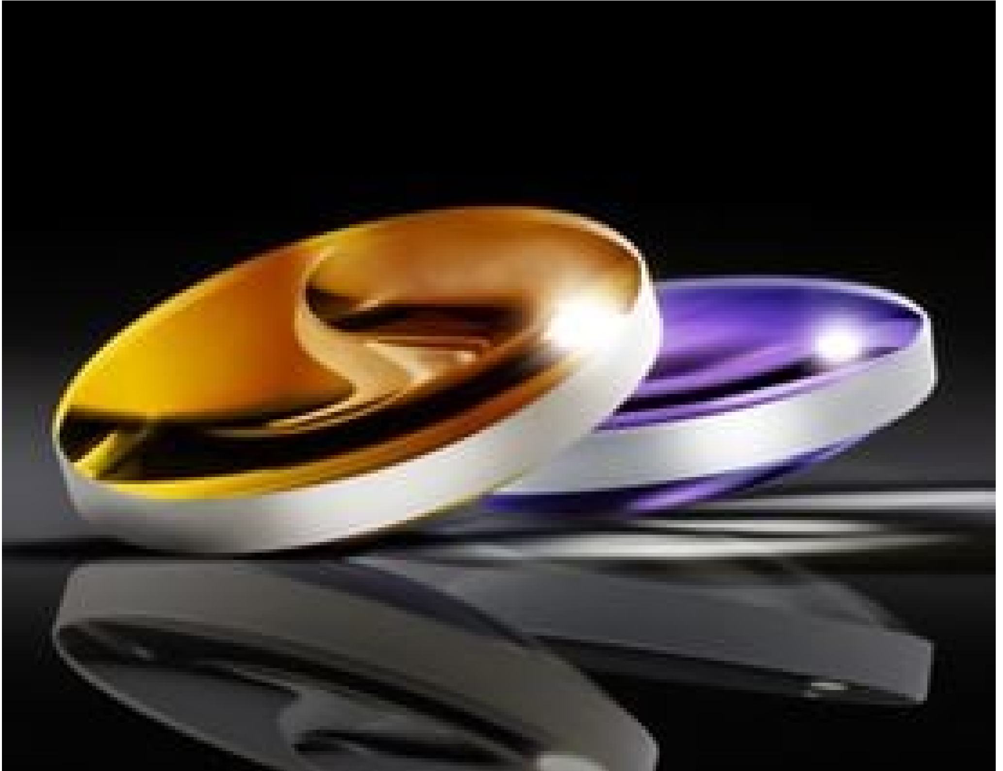
High Precision Laser Grade Aspheric Lenses