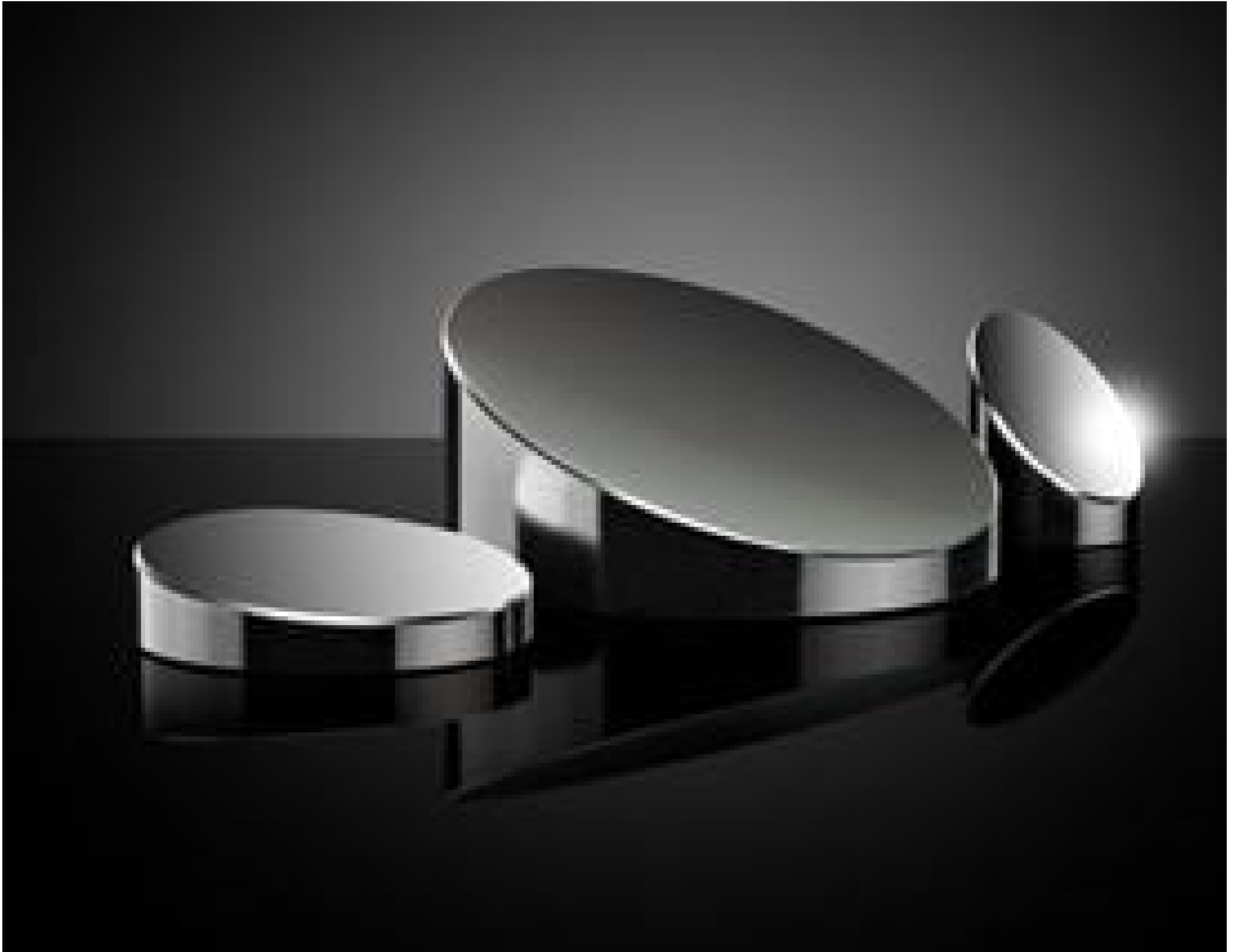
TECHSPEC Aluminum Off-Axis Parabolic Mirrors