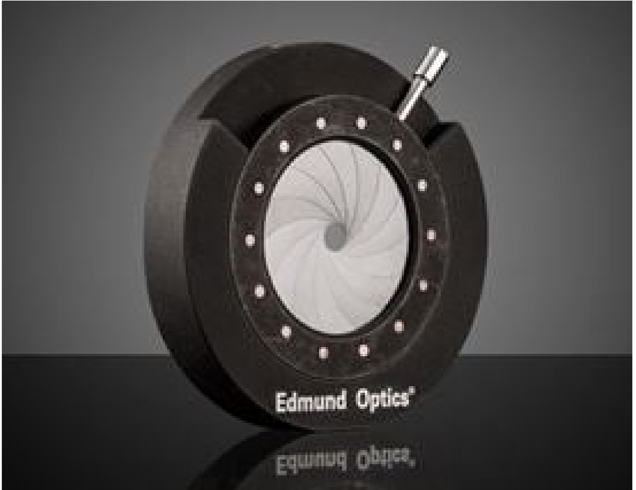
50.8mm Outer Diameter, Mounted Iris Diaphragm, #53-915