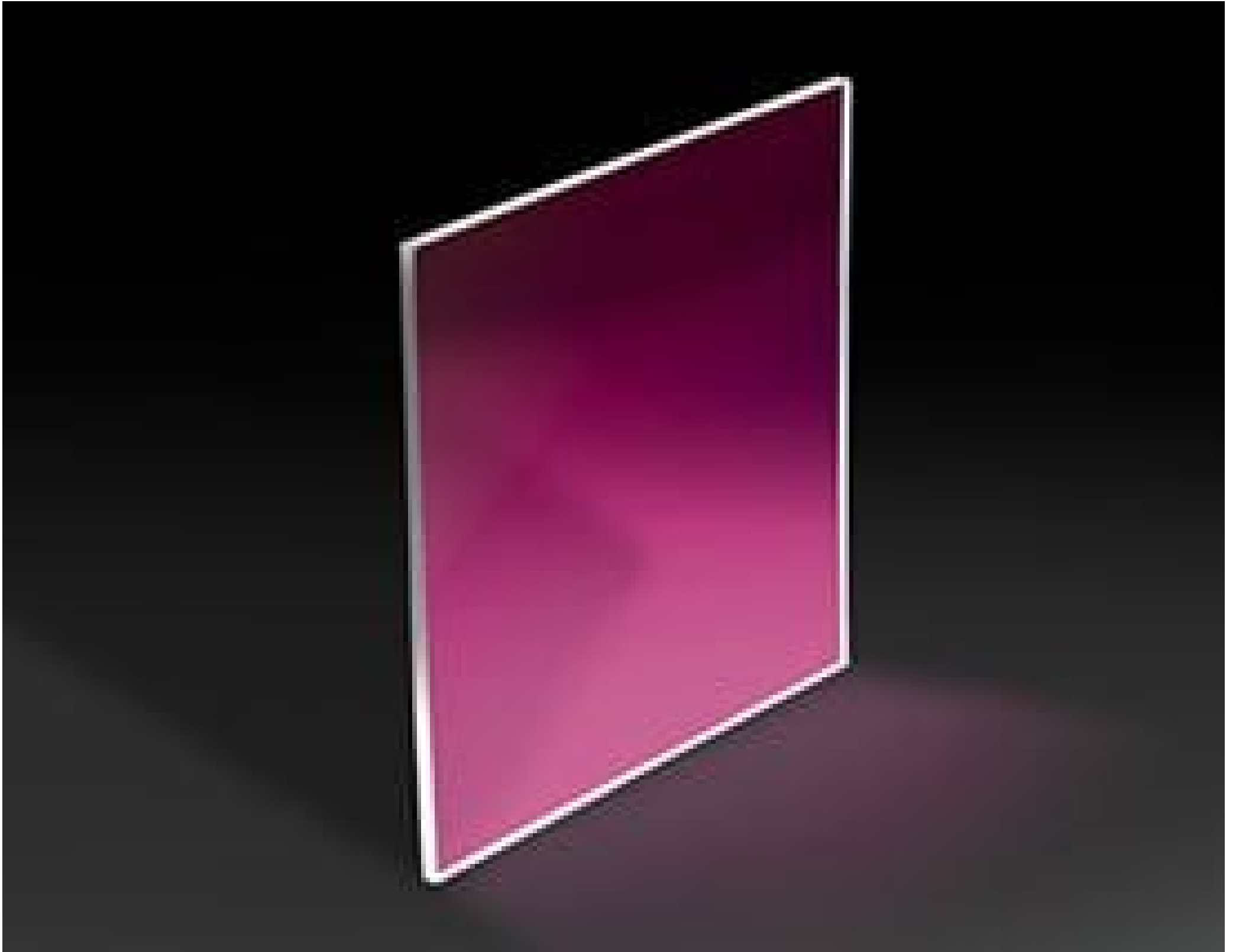
Gorilla® Glass Windows