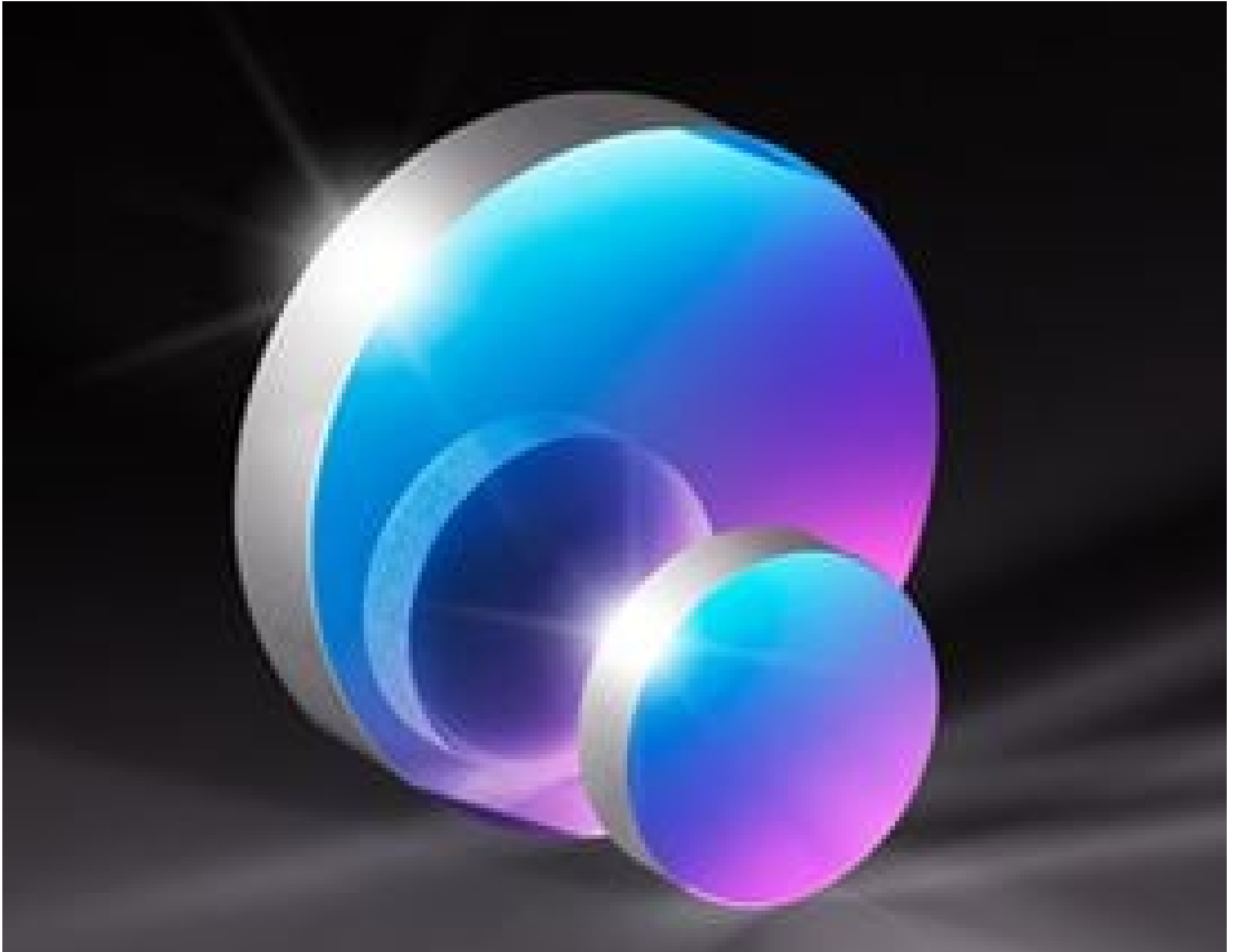
Precision Ultraviolet Mirrors