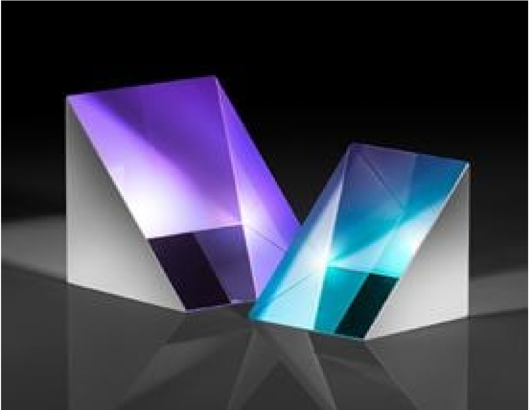
N-BK7 Right Angle Prisms