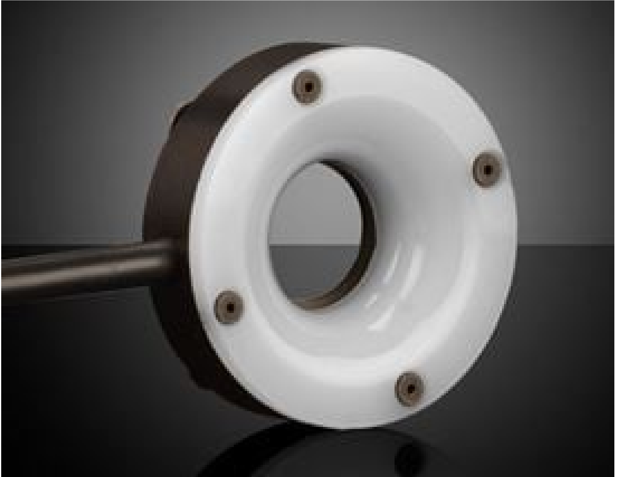
Advanced Illumination MicroBrite Diffuse Darkfield Ring Lights

Stock #18-557-RCD-05P RECERTIFIED 1 In Stock