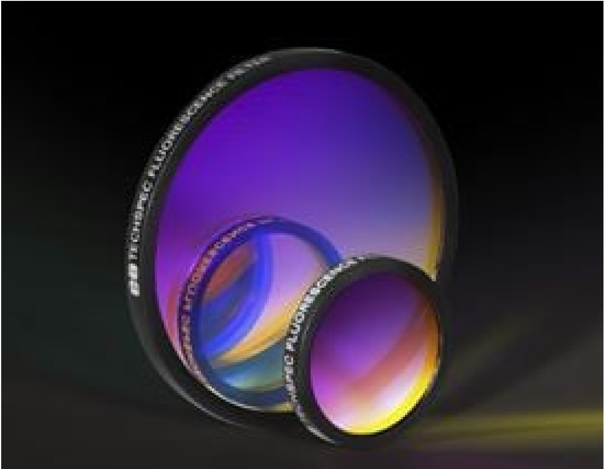
Multi-Band Fluorescence Bandpass Filters