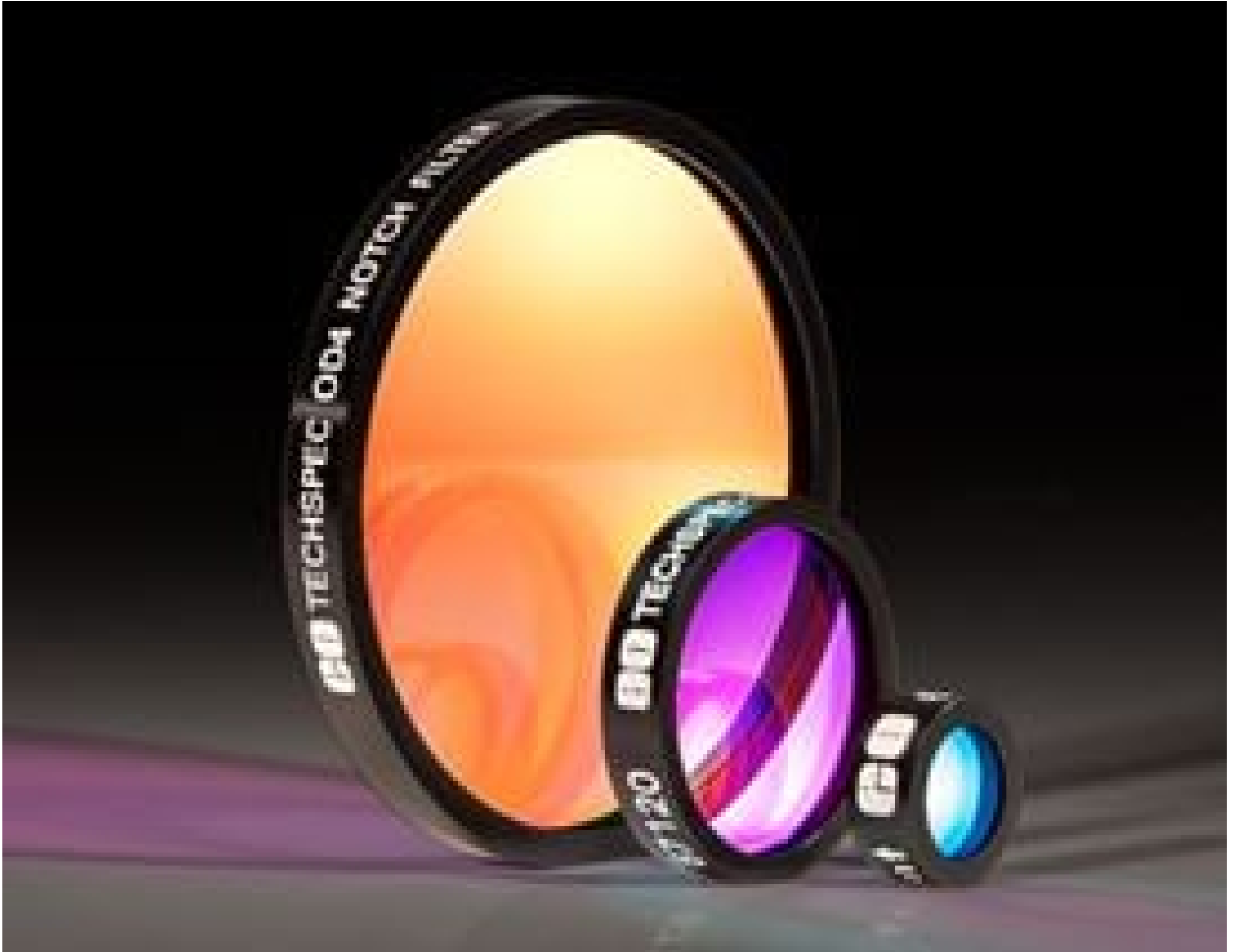
TECHSPEC OD 4.0 Notch Filters