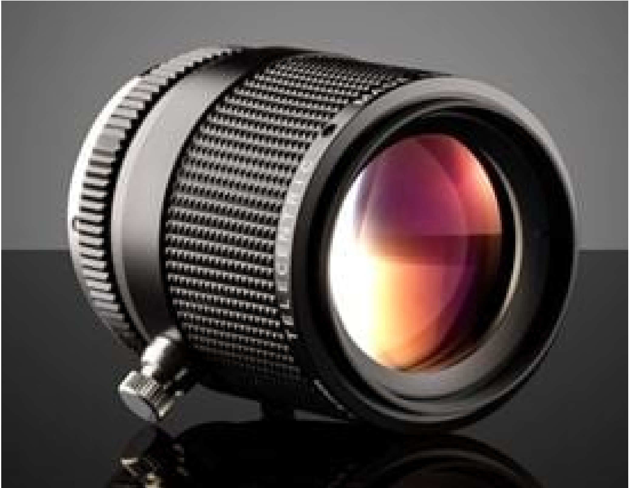
55mm Focal Length Partially Telecentric Video Lens, #52-271