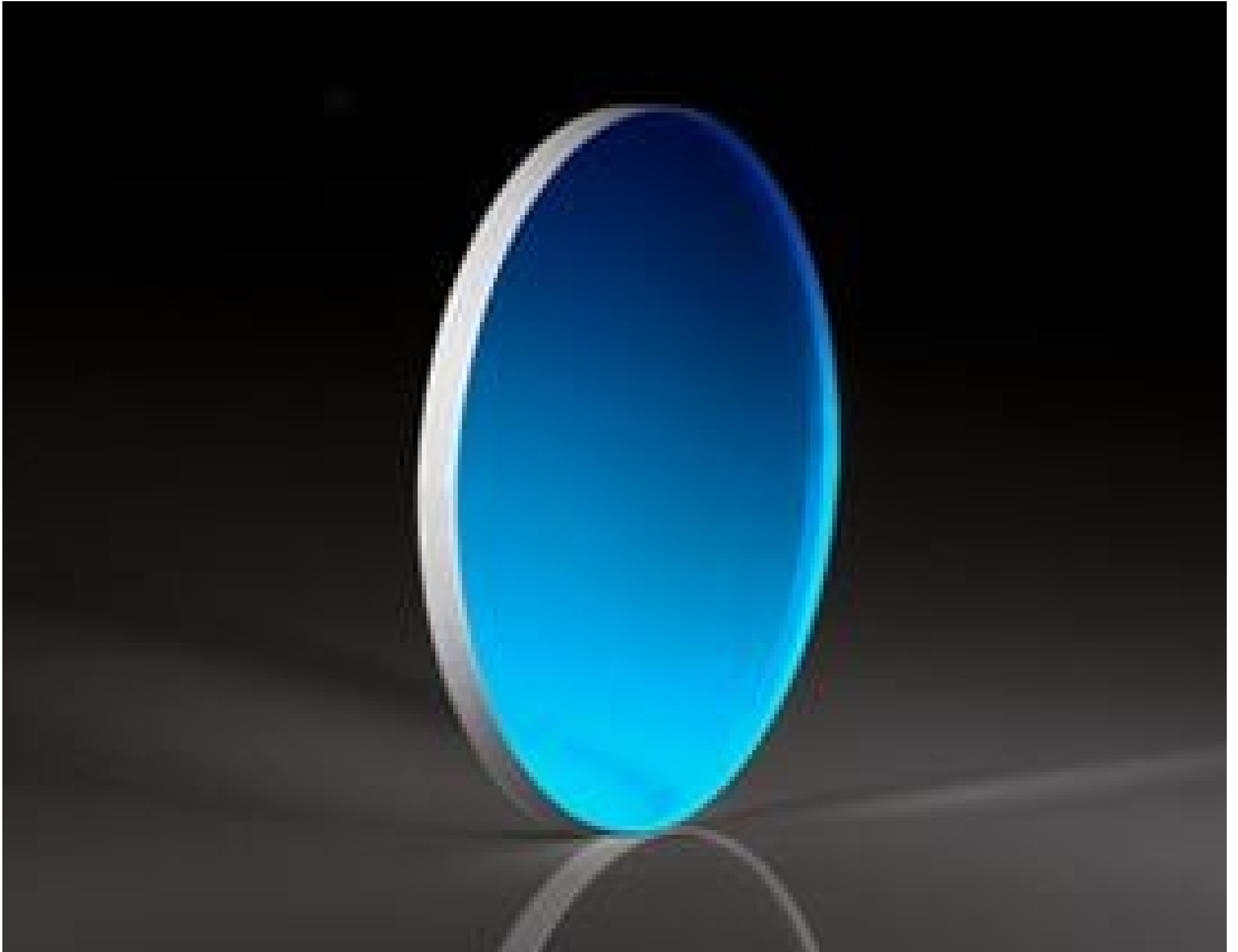
Uncoated \lambda/20 Fused Silica Window