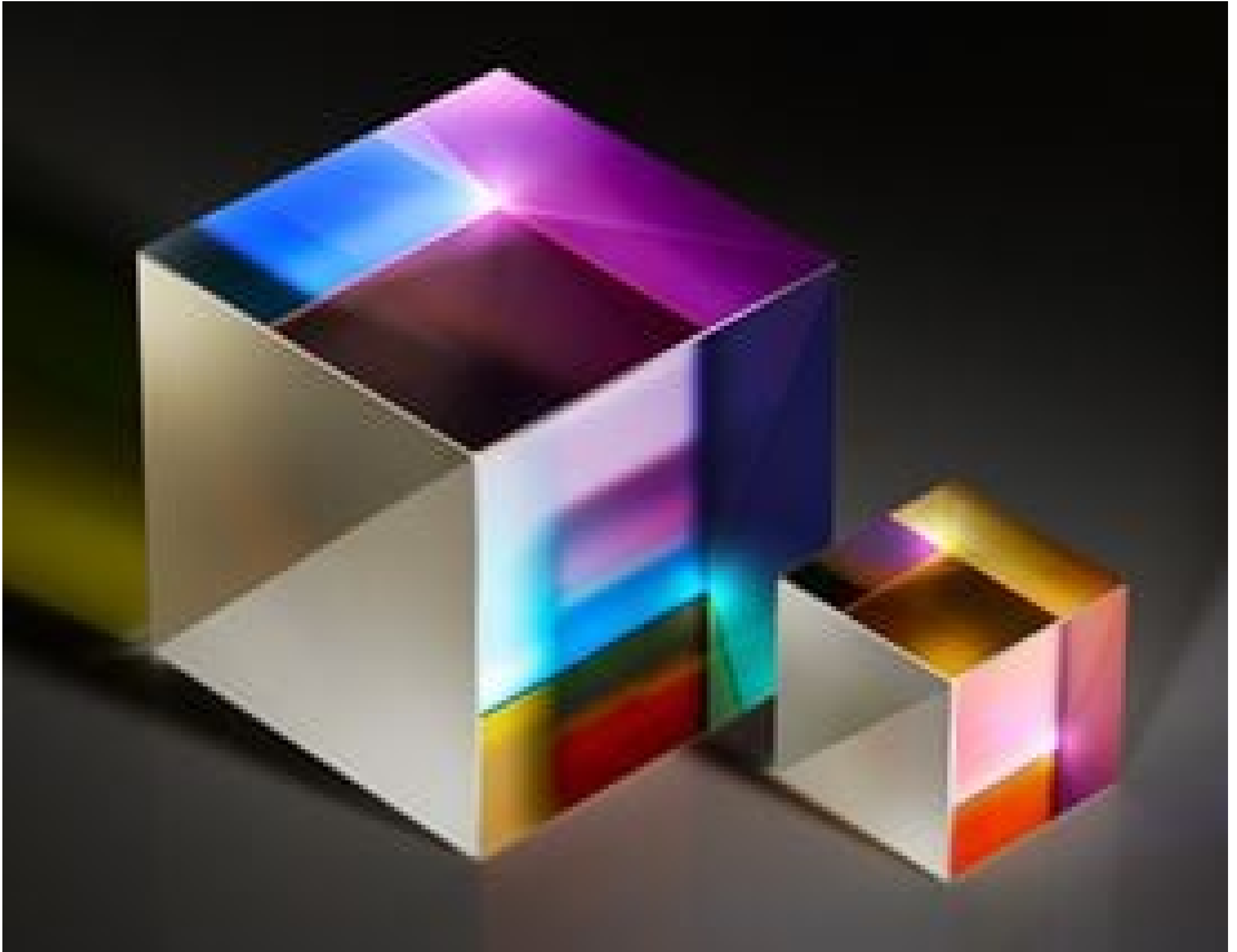
TECHSPEC® Broadband Polarizing Cube Beamsplitters