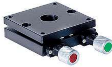
Metric Tilt Platform