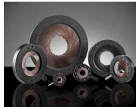
#32-618 - 37mm Max. Aperture, Iris Diaphragm C$132.30