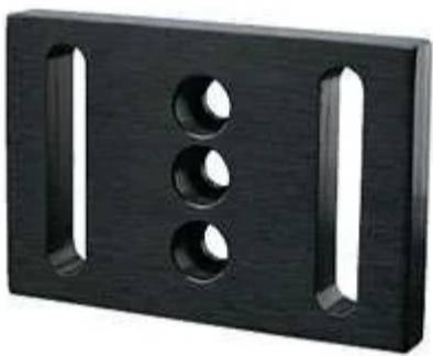
#03-655 - Sliding 2" x 3" Base Plate C$35.35