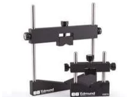
#03-669 - 7.0 - 67.0 Optic Height, English Bar-Type Optic Holder C$162.40