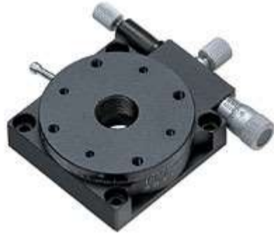
Metric Rotary Stages