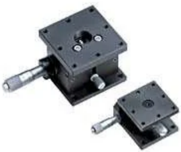
Metric Z-Axis Stages