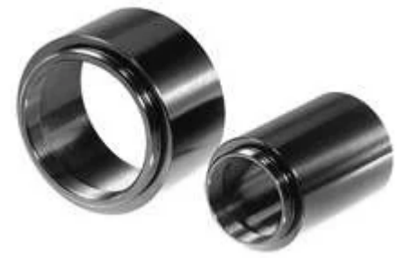
#63-955 - 5mm Length, S-Mount Extension Tube C$37.80