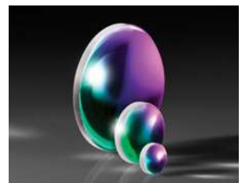
1064nm Laser Line Coated Fused Silica PCX Lenses