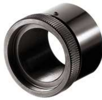
#63-953 - 17.5mm - 25mm Length, S-Mount Fine Focus Tube C$100.80