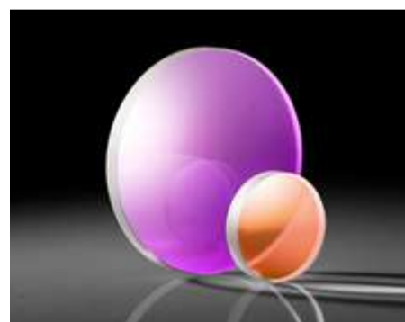
Laser Grade Plano-Convex (PCX) Lenses