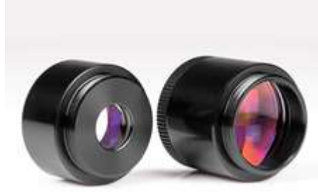
#63-941 - 6mm Diameter, S-Mount Thin Optic Mount C$57.05