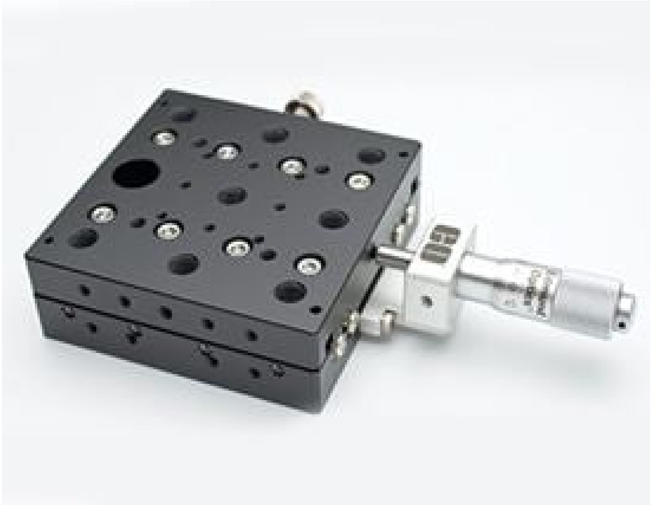
#66-427 - 70mm, 0.5" Travel, Micrometer Drive Stage (Center Drive)