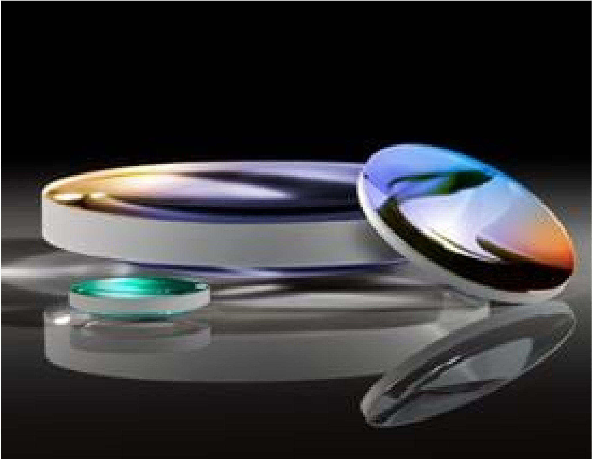
YAG-BBAR Coated Plano-Convex (PCX) Lenses