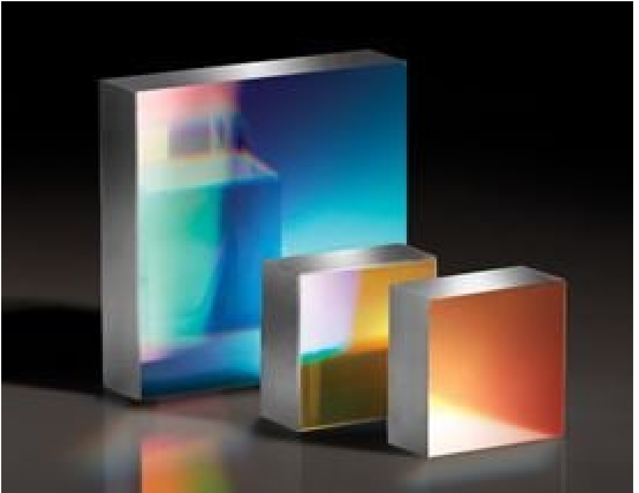
Richardson Gratings™ High Precision Plane Ruled Reflective Diffraction Gratings