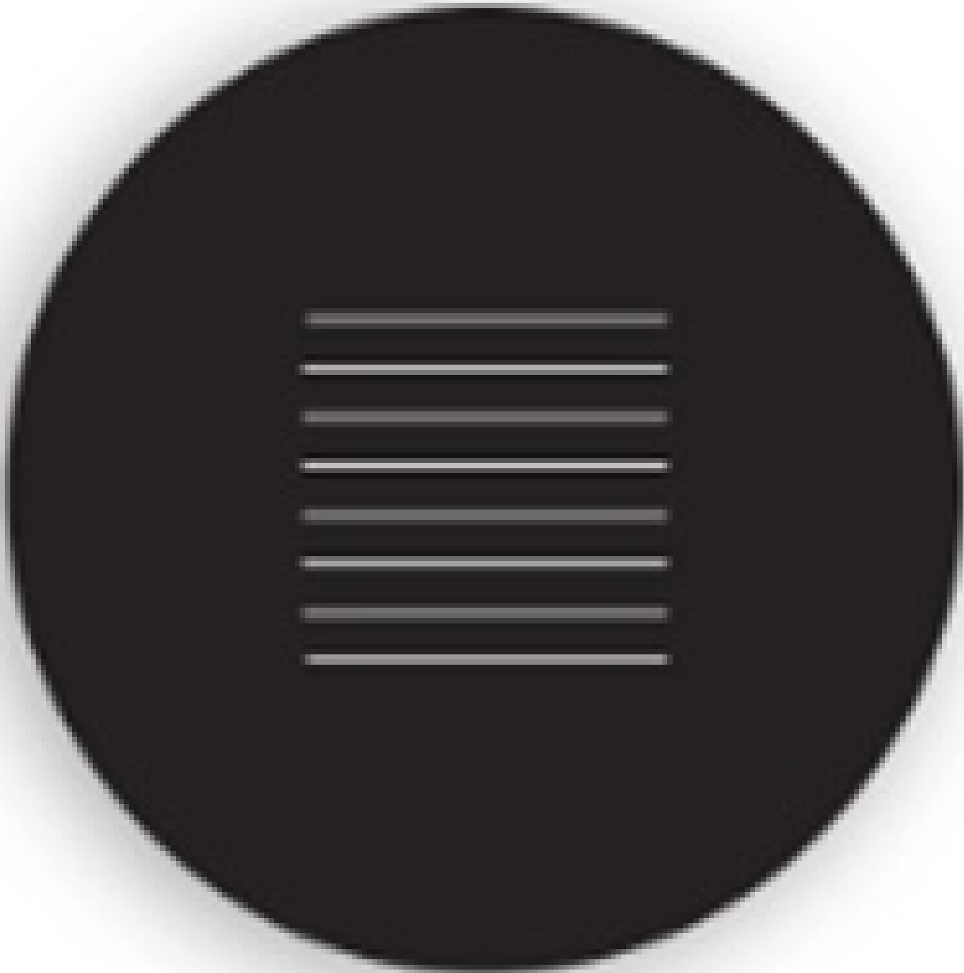
#88-520: 8 Line Reticle for Pattern Projectors