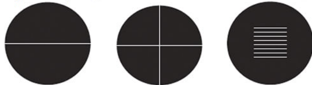
7 x 7 Grid Reticle (#88-521) Edge Reticle (#88-522)