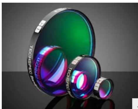
High Transmission Traditional Coated Bandpass Filters