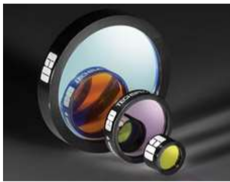
Traditional Coated 400 – 699nm Bandpass Interference Filters