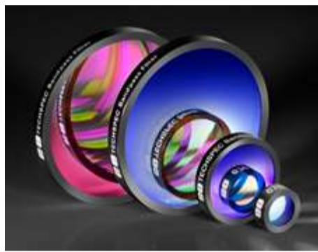
Hard Coated OD 4.0 10nm Bandpass Filters