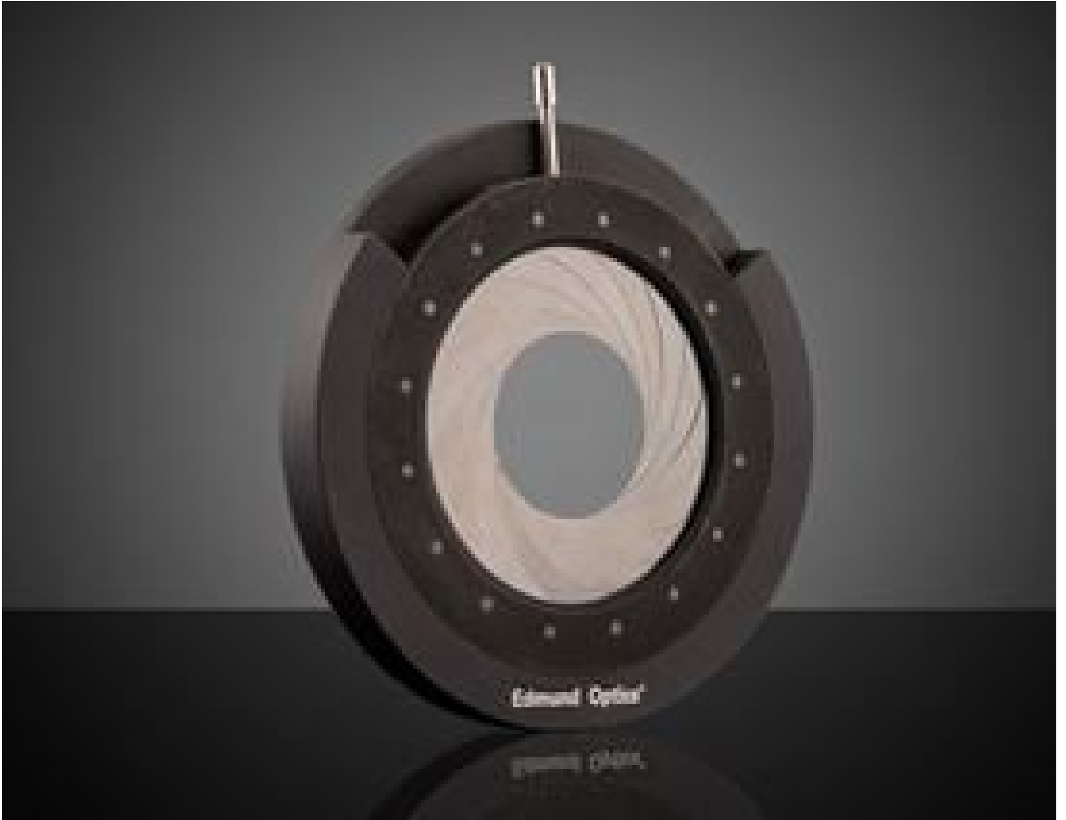
86mm Outer Diameter, Mounted Iris Diaphragm, #53-917