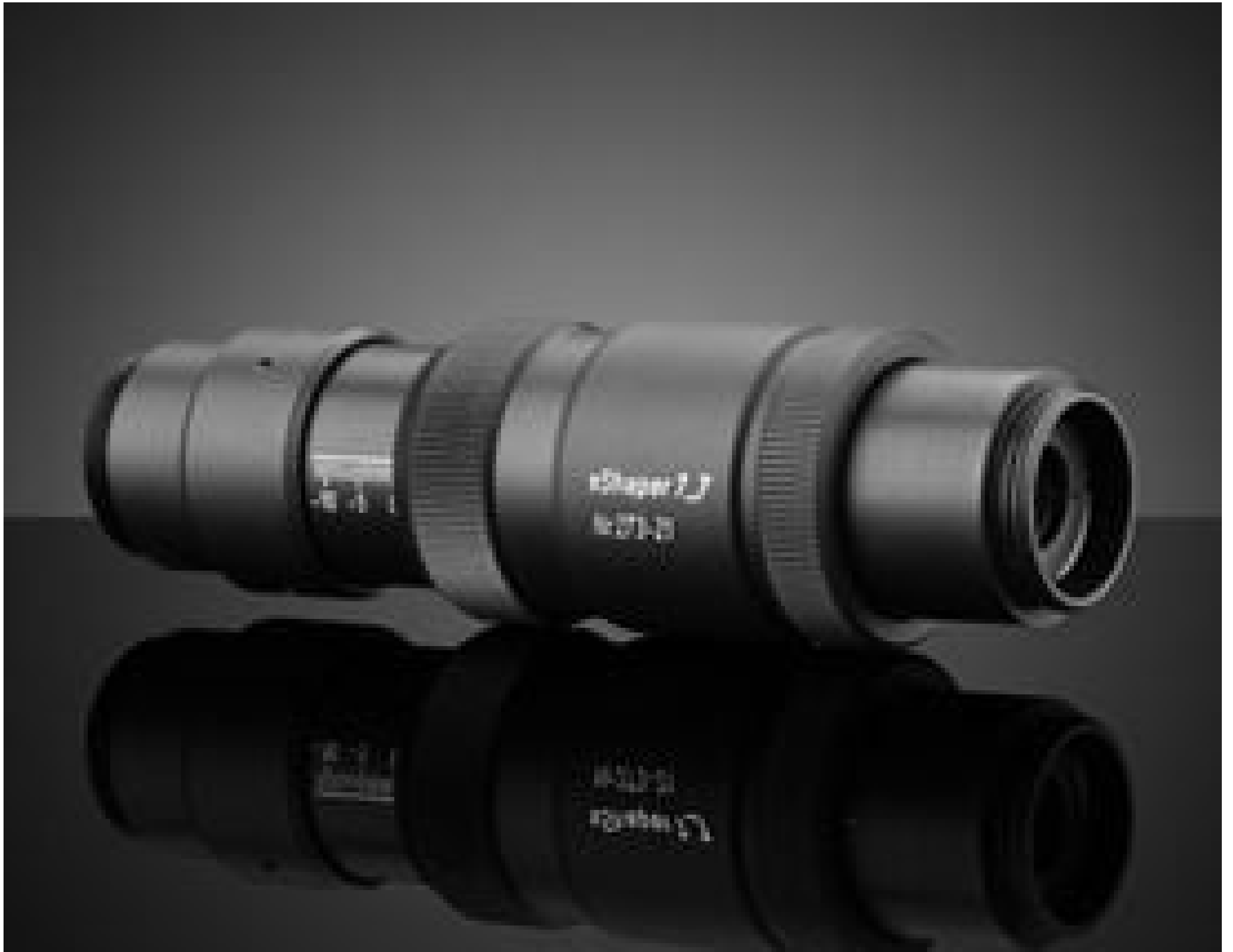
#25-838: 9.4µm Flat Top Beam Shaper | πShaper 7_7_9.4