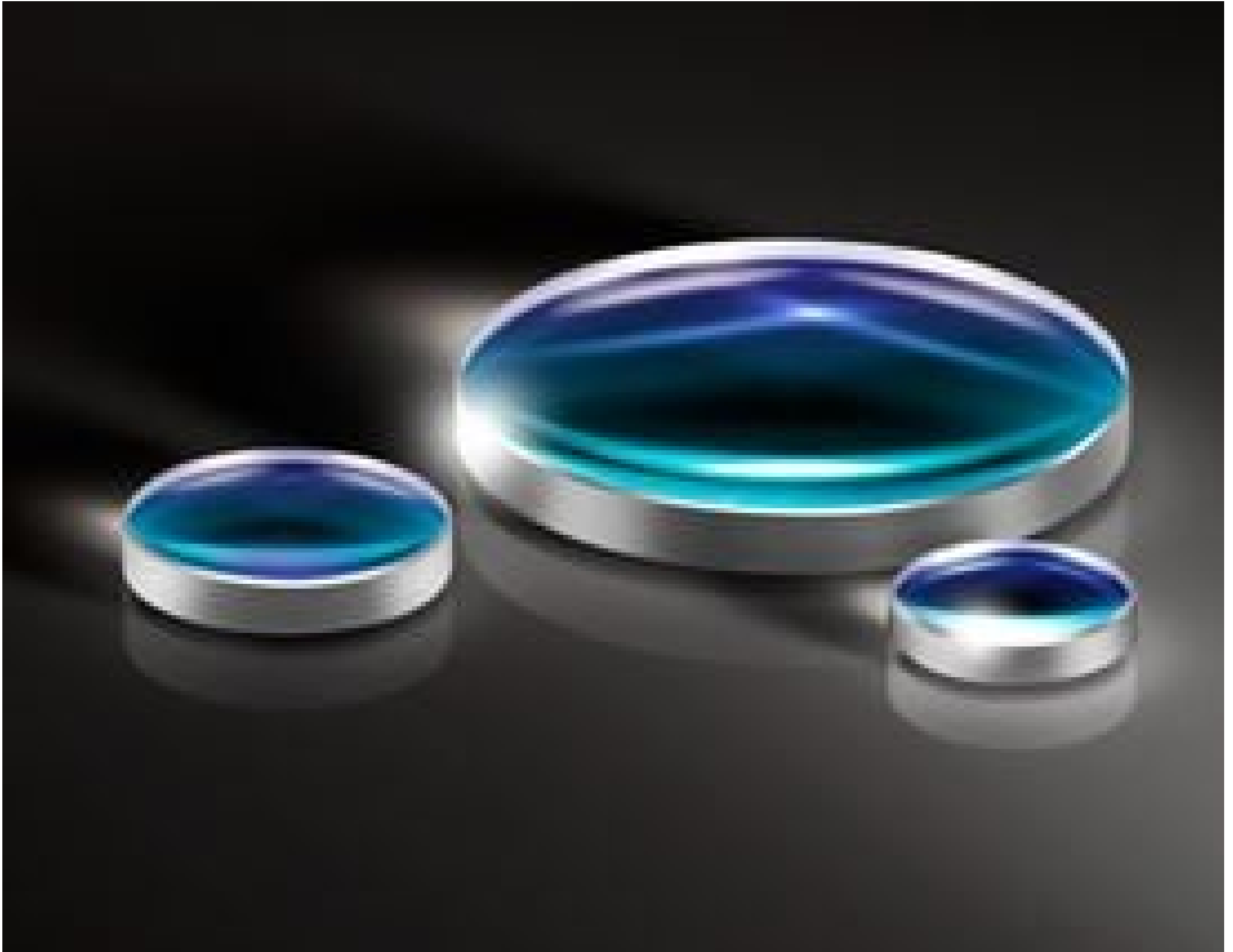
UV Fused Silica Double-Convex (DCX) Lenses