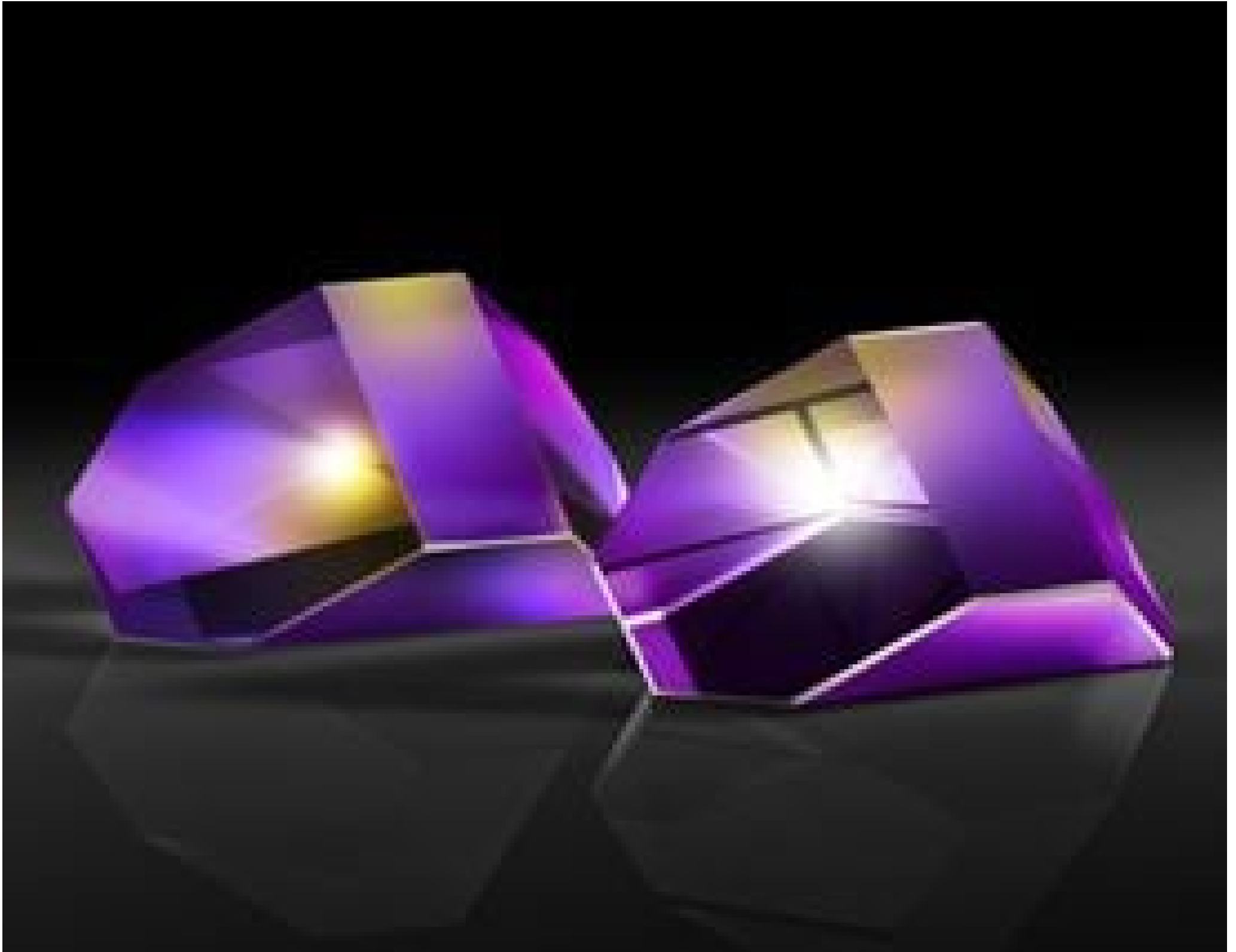
Amici Roof Prisms